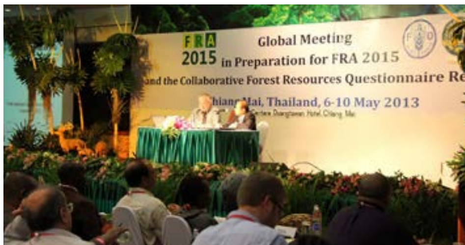
Plenary session of the Global Meeting in Preparation for FRA 2015 and the Collaborative Forest Resources Questionnaire Reporting in Chiang Mai, Thailand 6–10 May, 2013.

Analysis and packaging of FRA 2015 results revealed the need to highlight regional differences in ways that would facilitate debates on forests and forestry at regional conferences or by regional Forestry Commissions.