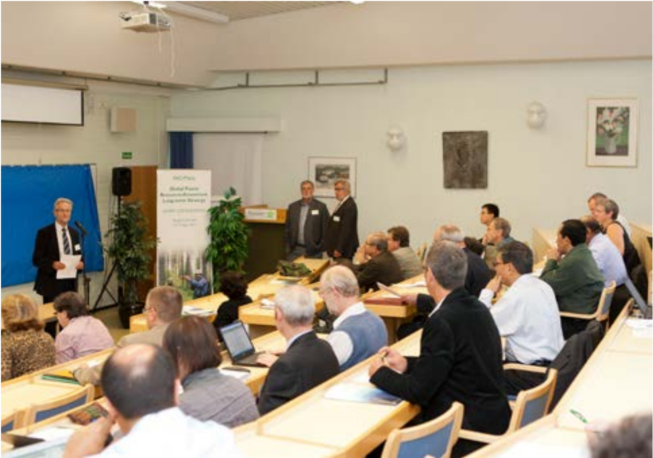
Participants at the sixth Expert Consultation on “A Long-term Strategy for Global Forest Resources Assessment,” plenary discussion, Nastola, Finland September 2012.