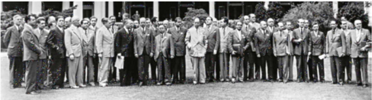
The Hot Springs Conference on Food and Agriculture held in Virginia, United States of America that laid the foundation for FAO in May 1943.