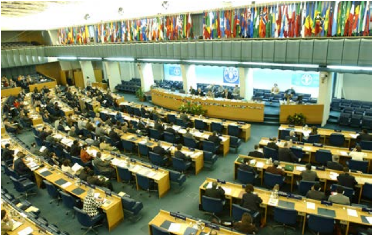
General view of the opening of a Session of the Committee on Forestry, held in the Plenary Hall, FAO headquarters, Rome, Italy, March 2005.

information and the type of data by country; this revealed that for 15 countries, covering 40 percent of the closed forest area, the estimates for the area of forest and deforestation were very good or good.