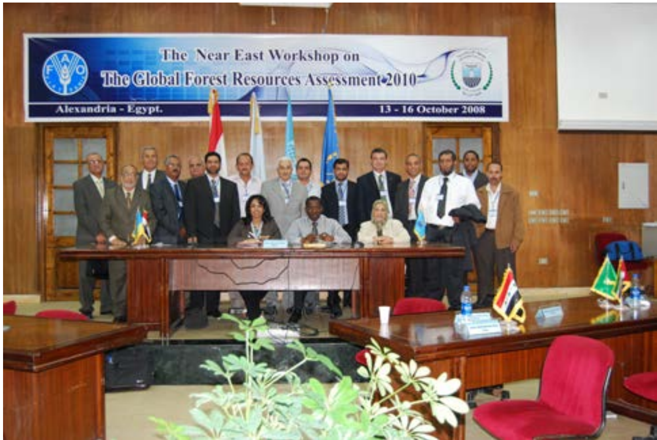
Participants at the Regional Workshop for national correspondents and focal points for the Near East regions in Alexandria, Egypt, 13–16 October 2008.