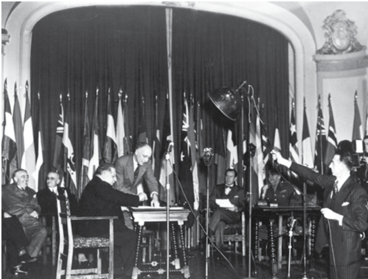
The foundation of FAO held in October 1945 at the Château Frontenac, Quebec, Canada.