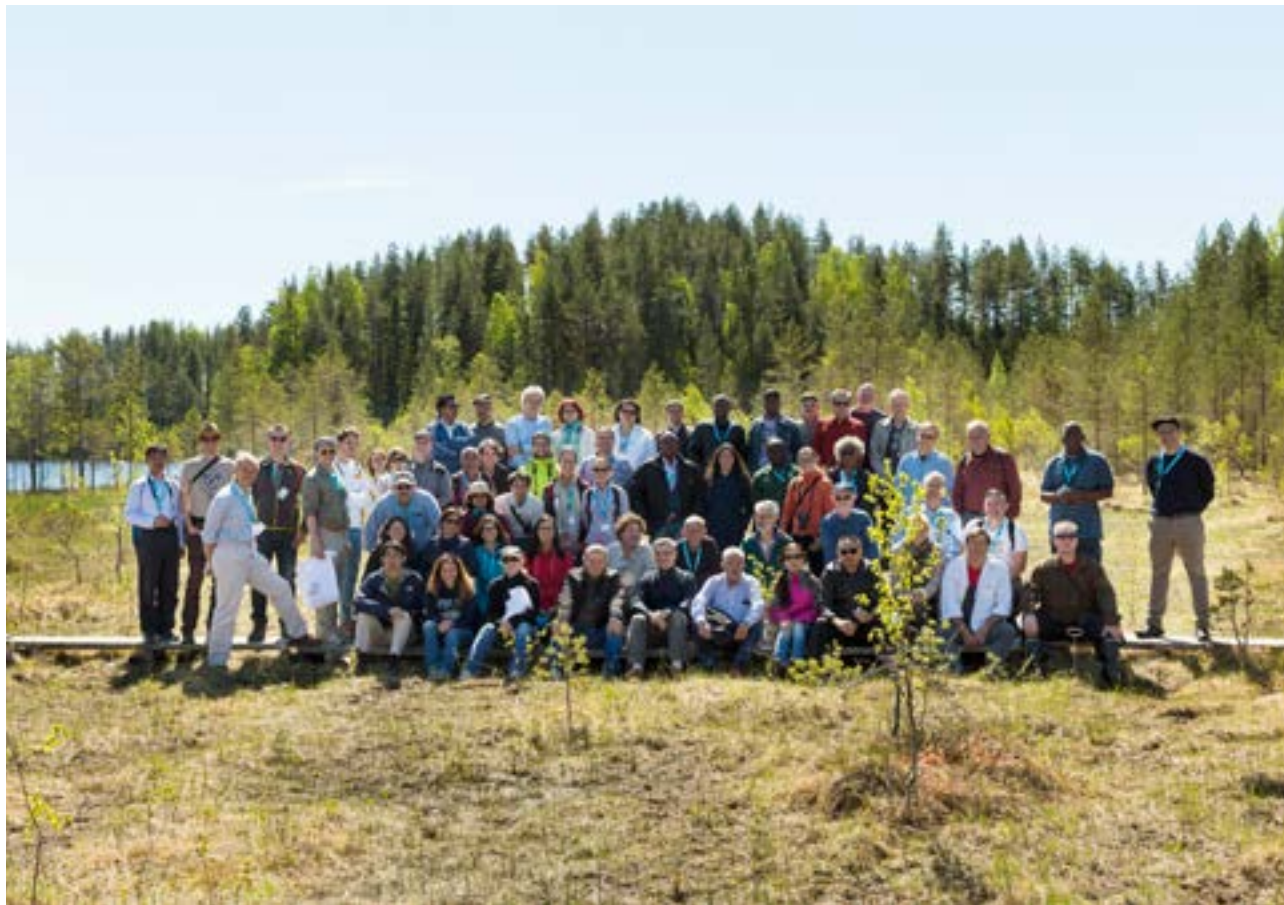
Participants at the seventh Expert Consultation on Global Forest Resources Assessment (FRA): Towards FRA 2020, group photo from the field trip, Joensuu, Finland June 2017.