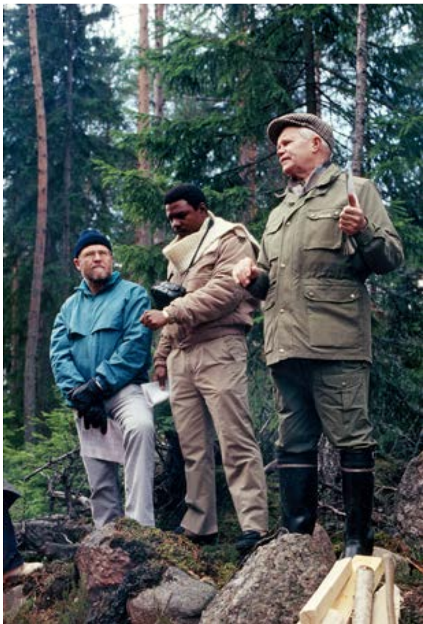
Participants at the first Ad Hoc FAO/ECE/ FINNIDA Meeting of Experts on Global Forest Resources Assessment, in Kotka, Finland, October 1987.