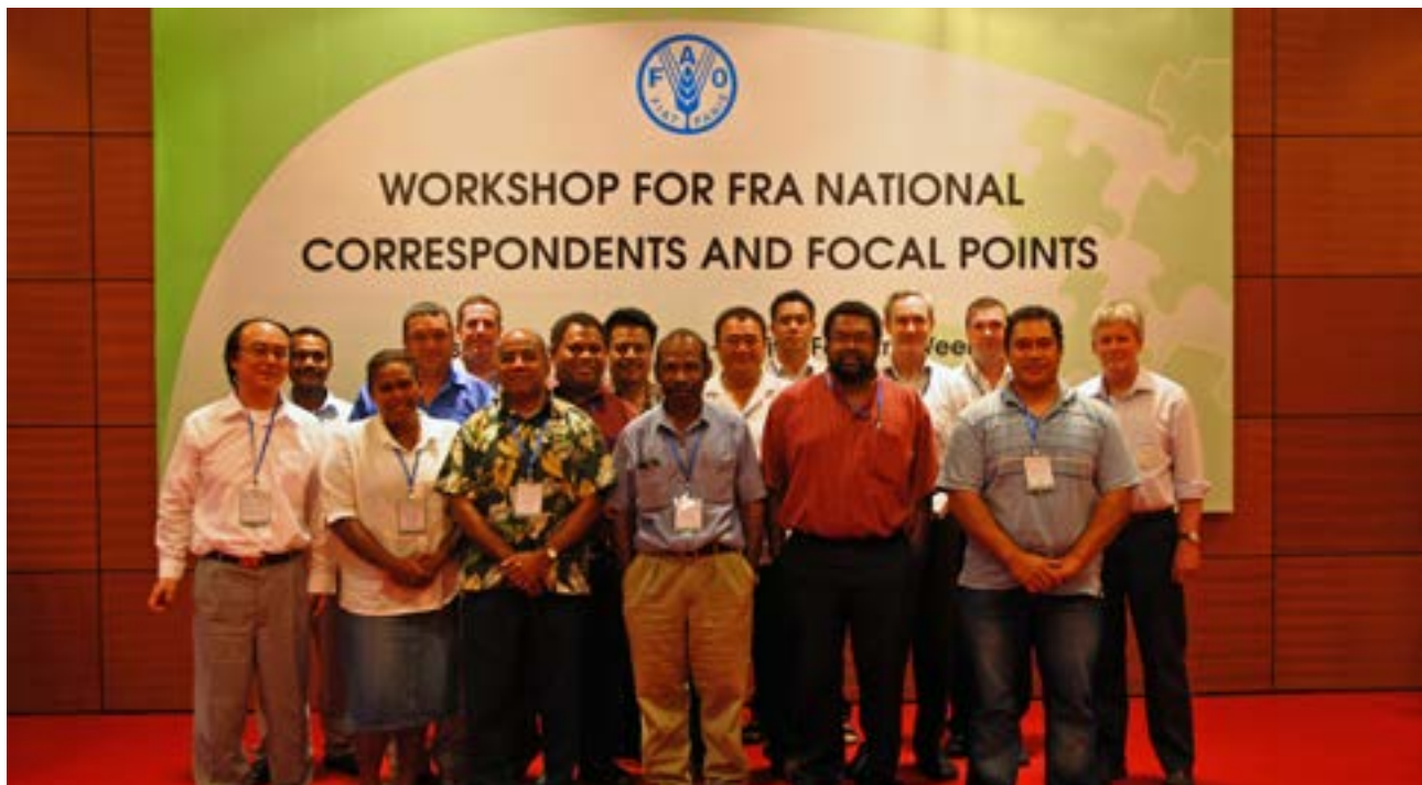
Participants at the Pacific Workshop on the Global Forest Resources Assessment 2010, in Hanoi, Vietnam 18–20 April 2008.

The main achievements of FRA 2010 were to obtain better data, improve the transparency of the reporting process, and enhance national capacity for data analysis and international reporting. The participation of national experts from around the world and key international forest-related organizations ensured the sharing of the best and most recent forest information that could then be published and be made readily available for policy decision-makers.