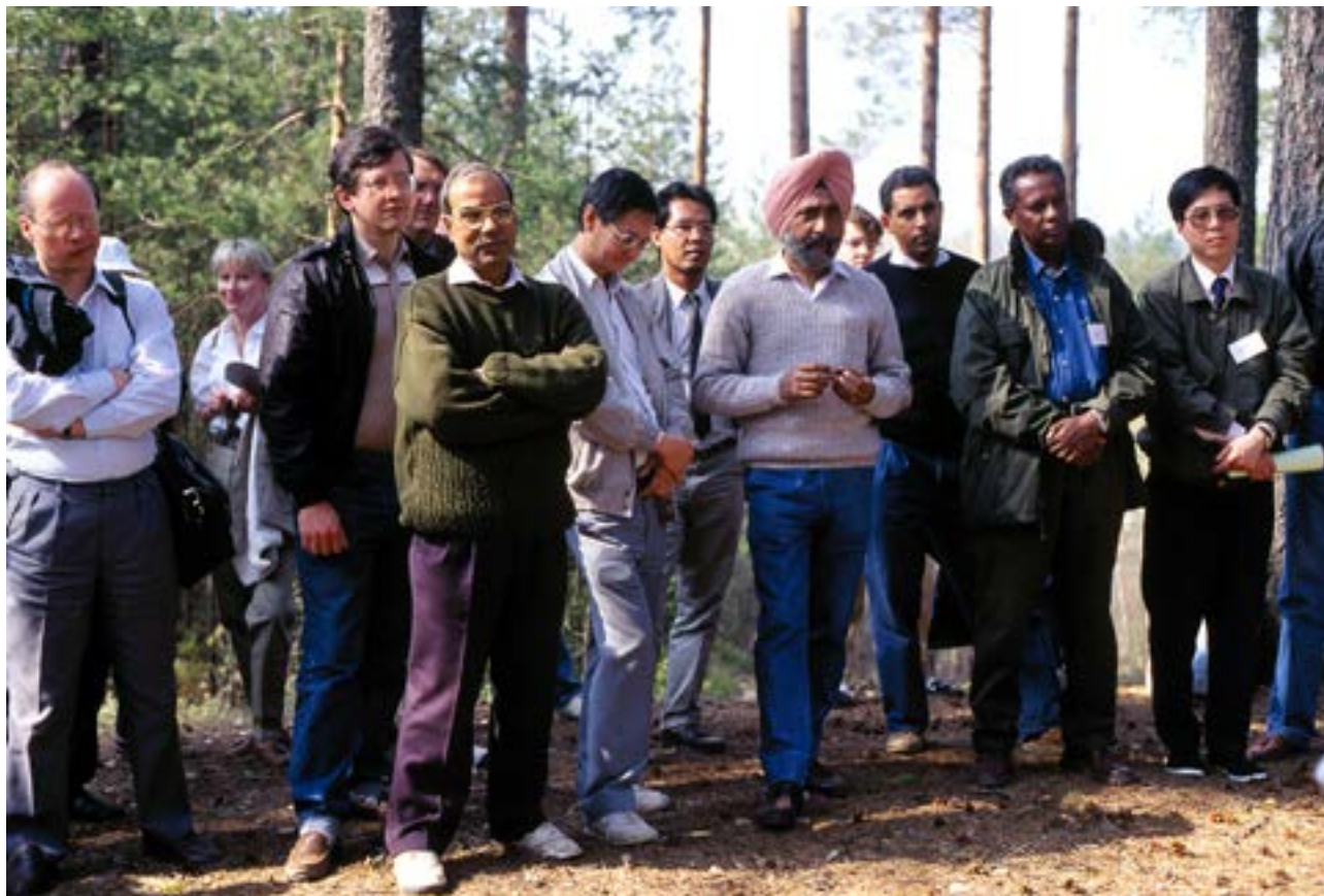
Participants at the second FAO/ECE Meeting of Experts on Global Forest Resources Assessment, during the field trip in Kotka, Finland May 1993.