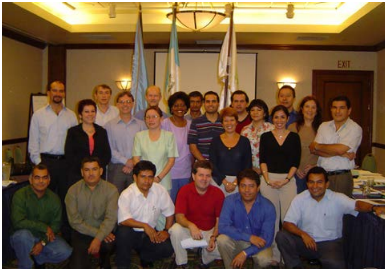
Participants at the Meeting of the FRA National Correspondents for Latin America, Guatemala 6–10 September 2004 Workshop.