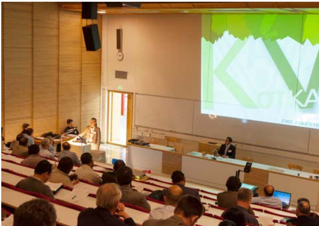
Participants at the fifth Expert Consultation on Global Forest Resources Assessment: Towards FRA 2010, plenary discussion, Kotka, Finland June 2006.