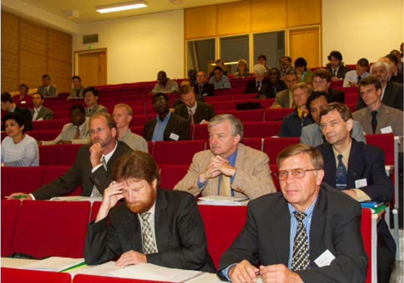
Participants at the fourth Expert Consultation on Global Forest Resources Assessment: Linking National and International Efforts, technical session, Kotka, Finland July 2002.