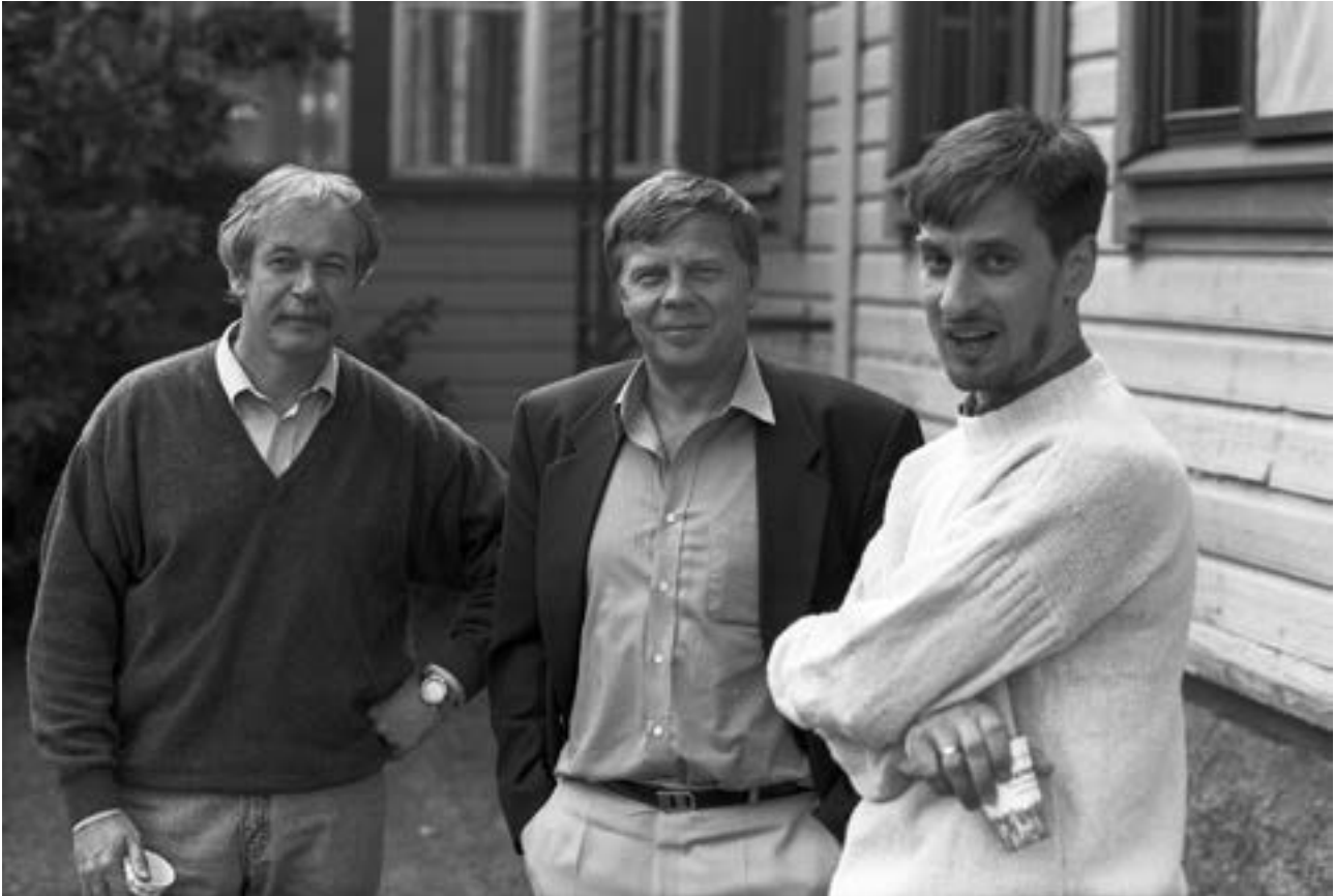
Participants at the third Expert Consultation on Global Forest Resources Assessment 2000, informal discussion, Kotka, Finland June 1996.