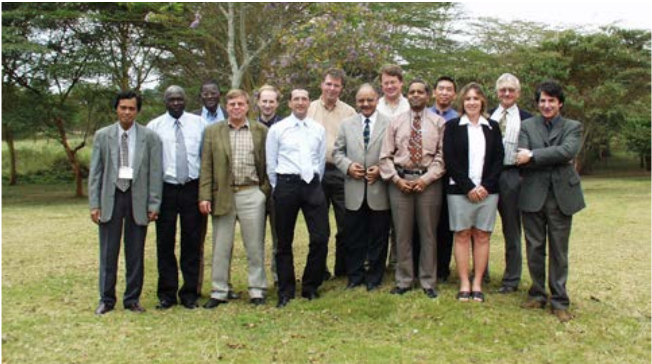
Participants at the first meeting of the Advisory Group to the Global Forest Resources Assessment, 16–18 October 2002, Nairobi, Kenya.

The FRA Advisory Group was established in 2002 on the recommendation of the Expert Consultation held in Kotka, Finland in 2002 (Kotka IV). The FRA Advisory Group is informal in nature, but is recognized by COFO which generally endorses its recommendations. The Group has a long-term commitment to meet annually. The role of the Advisory Group is to review FRA activities and outputs, and make recommendations to strengthen existing institutional networks and to make future forest resources assessments more user-oriented and demand-driven, and more closely linked with other international processes.