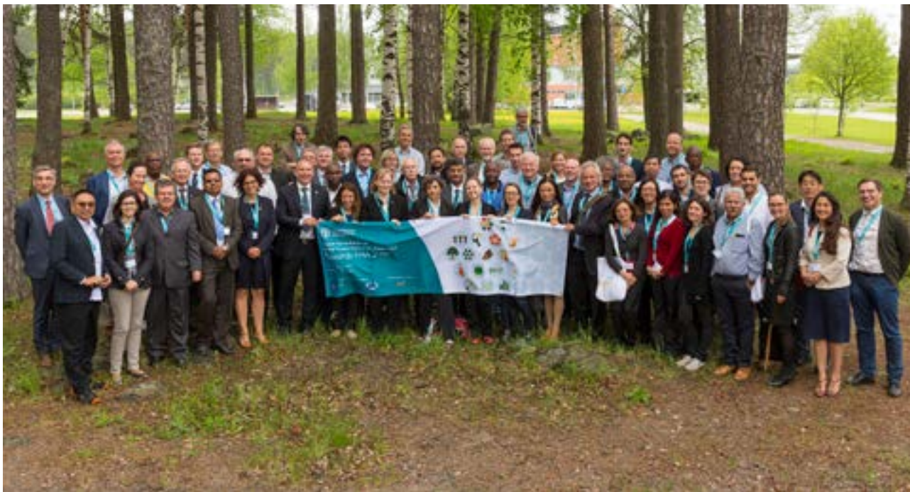
Participants at the seventh Expert Consultation on Global Forest Resources Assessment (FRA): Towards FRA 2020, Joensuu, Finland June 2017.