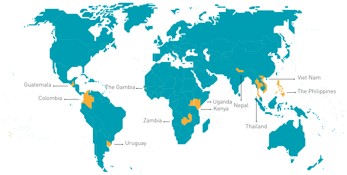
Note: the boundaries and names shown in this map do not imply official endorsement or acceptance by the United Nations

national planning and budgeting processes. This integration will help enhance institutional capacities and processes for operationalization of climate response strategies in the agricultural sectors as well as the facilitation of stronger partnerships between ministries of agriculture, environment, planning and finance, and other national partners.