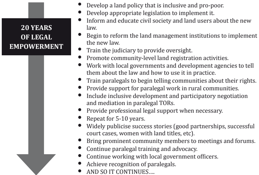
FIGURE 3 A long-term process of engagement and creating the context for effective 'paralegalism'

Of course there is no guarantee that this new knowledge will immediately be put to good use once it is acquired, either by the community or individual female or male farmer, or by the District Administrator or judge who attends