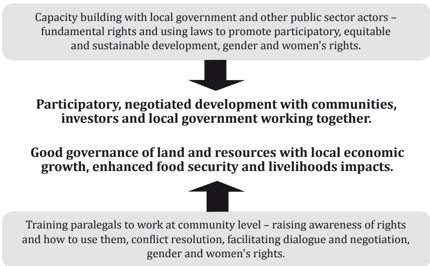
FIGURE 2 The 'twin-track' approach

The programme therefore has two main elements: training paralegals to provide community legal support and empowerment; and public sector capacity development and (implicitly) attitude-changing. The former has