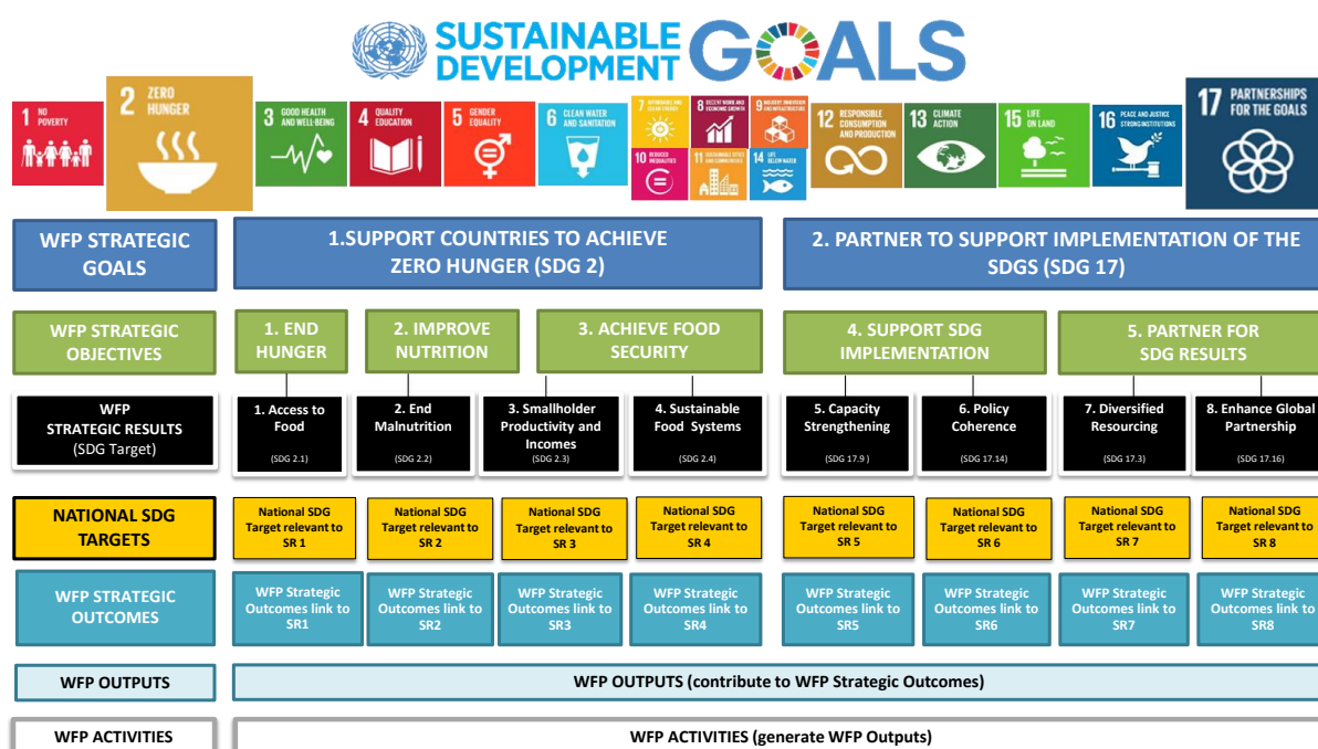
Figure 1: WFP Strategic Plan (2017–2021) results framework