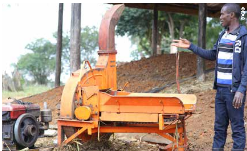
The forage chopper provided by the SSC Project. In the background are the silage pits.

The farm therefore appeals for introduction of appropriate mechanization to reduce drudgery in farm operations, additional capacity building and training on pasture agronomy, animal husbandry, post-harvest handling and value addition of milk products.