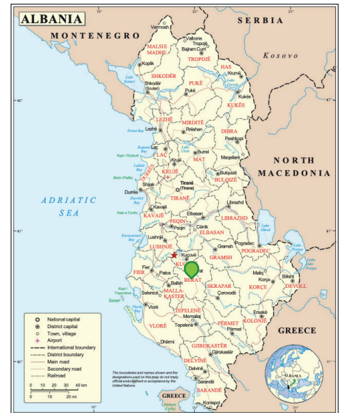
Source: Author's elaboration, conforms to Map No. 3769 Rev. 8 August 2020*

This practice was first introduced in Berat district, central Albania and has since been replicated in several other rural areas of the country. It is also suitable for other parts of the region that are in a similar stage of agricultural development.