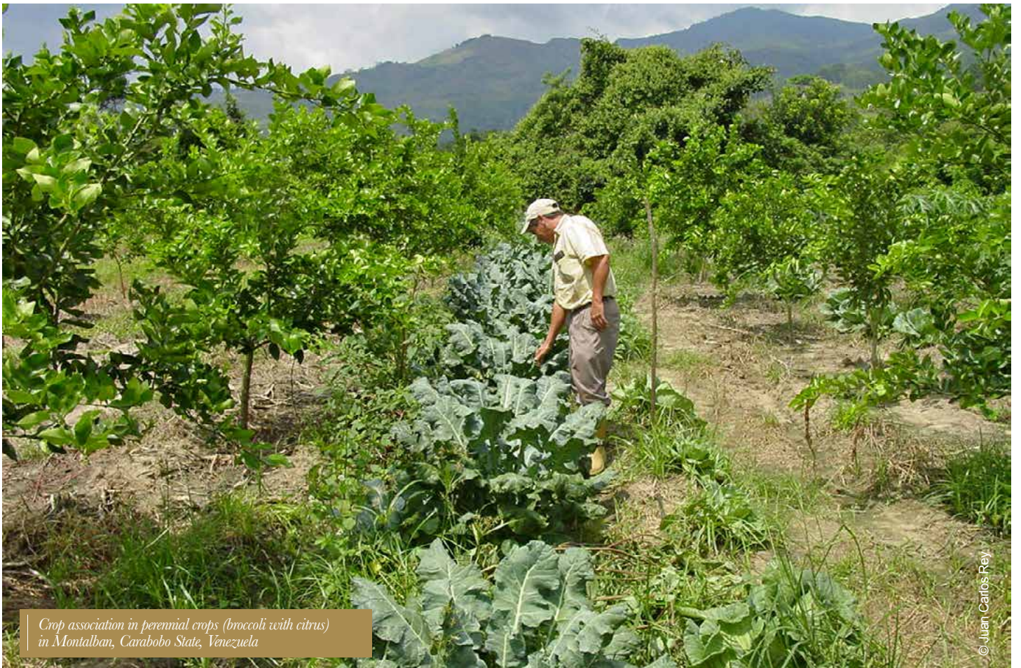
Crop association in perennial crops (broccoli with citrus) in Montalban, Carabobo State, Venezuela