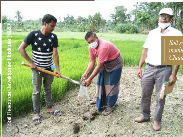
Soil sampling for monitoring soil health. Chandina, Bangladesh