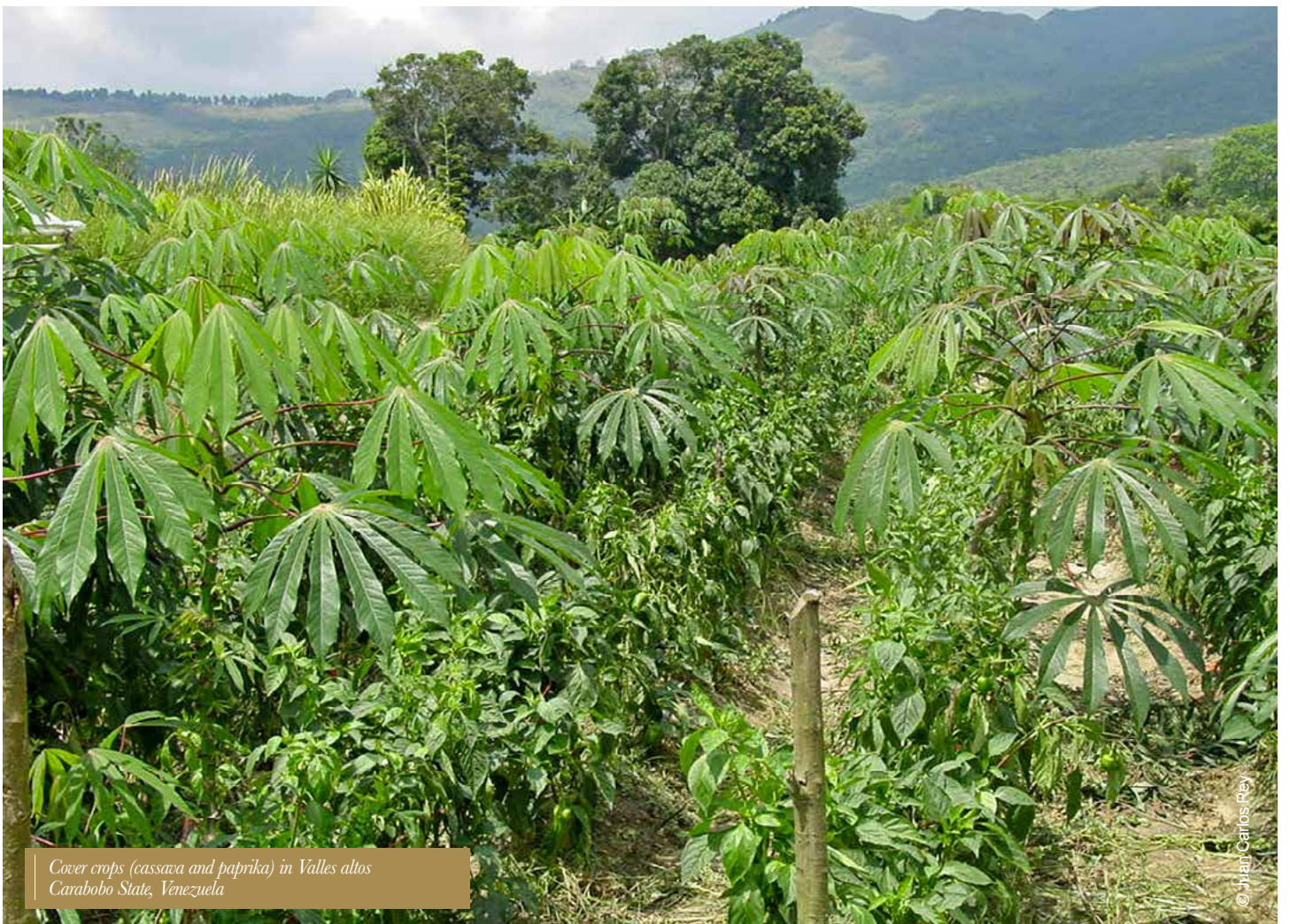
Cover crops (cassava and paprika) in Valles altos Carabobo State, Venezuela