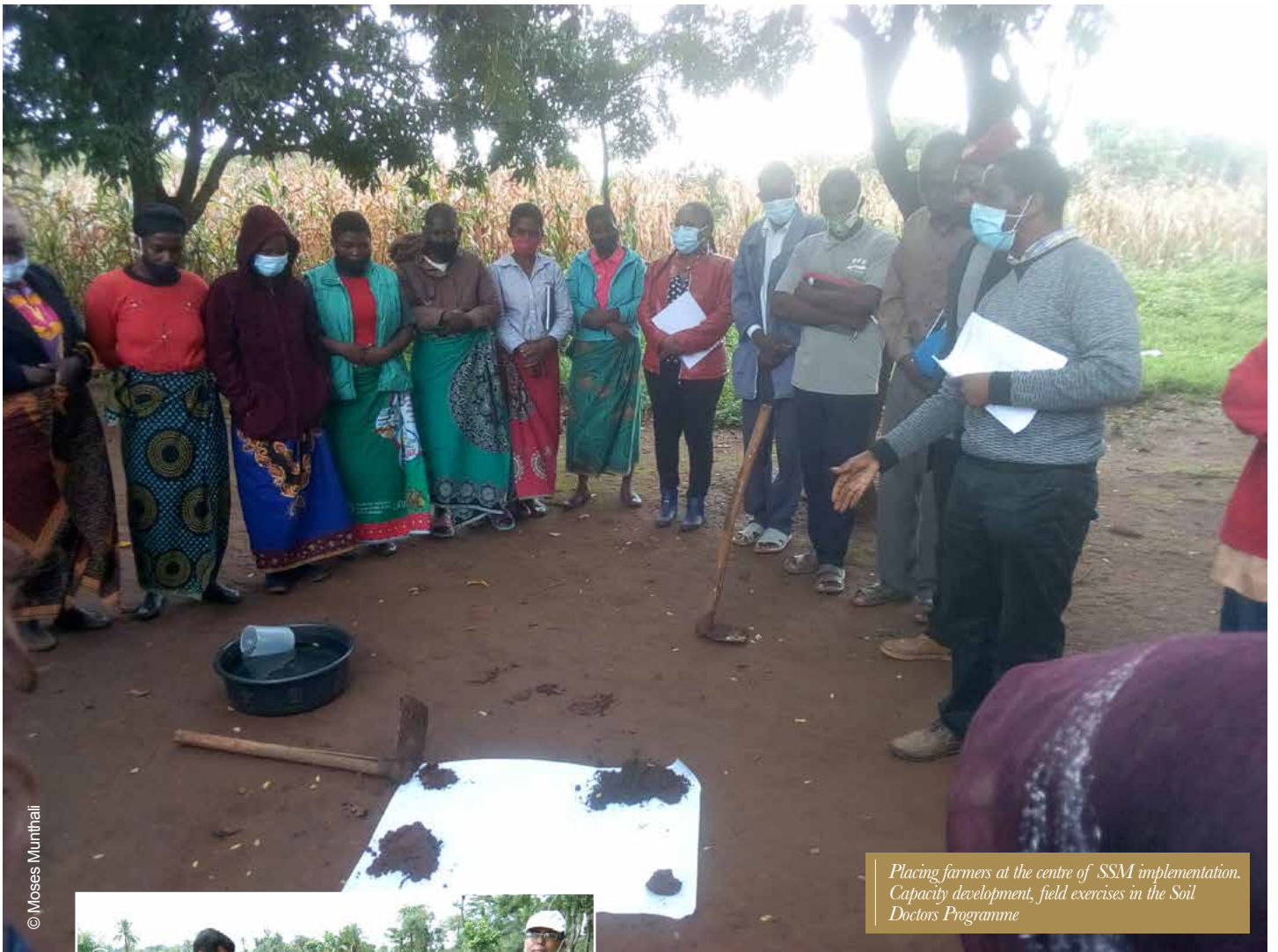
Placing farmers at the centre of SSM implementation. Capacity development, field exercises in the Soil Doctors Programme