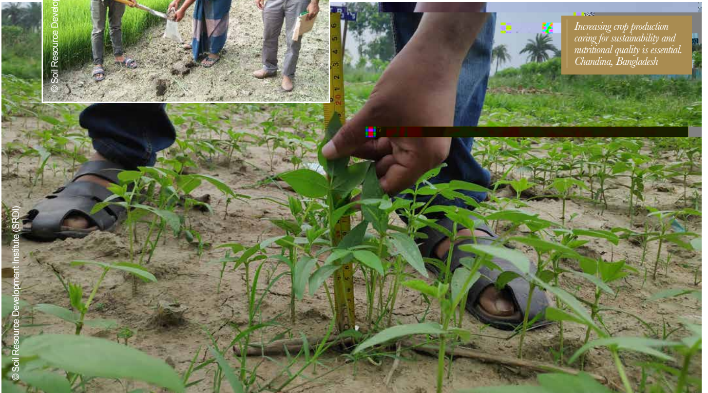
Increasing crop production caring for sustainability and nutritional quality is essential. Chandina, Bangladesh