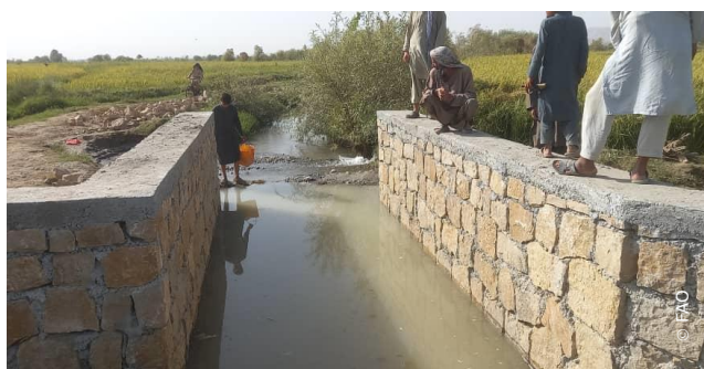
Completed Turkman Drainage in Faryab Province.

Nearly 2 790 households will soon access 7 727 ha of land for agriculture once the construction of 11 culverts and three flumes along the Juy Turkman Drainage is complete. The 20 km drainage will be accessed by residents of Kool Wakil Pahlwawan, Qorghon Tapa Afghani-ia Qishlaq Wardakha, Qool Yaqa, Nawabad Wardakha, Kharoti, Nagma Bazar, Khawaja Bar Ali, Pasha-e, Qorghon Tapa villages.