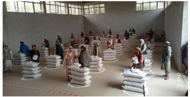
Distribution of livestock protection package to the herders Qala-e-Naw Baghis.

Nearly 135 households in Badghis Province received inputs for mushroom, beekeeping and microgreen house package. This emergency livelihood assistance is to safeguard food security and local food production of the most rural vulnerable. A further 2 550 vulnerable livestock based households received 200 kg animal feed, three kilograms of fodder crops and 0.5-liter dewormer per unit to safeguard their livestock. 730 food insecure families affected by multiple shocks received poultry house construction material, feeders and 30 pullets per household.