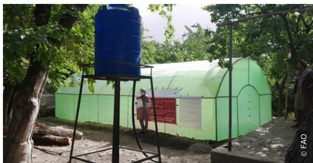
Greenhouse installed on Badakhshan.

Green houses and solar driers were installed for 45 vulnerable women headed households in Wakhan district of Badakhshan province which would enable them to grow and dry fruits and vegetables.