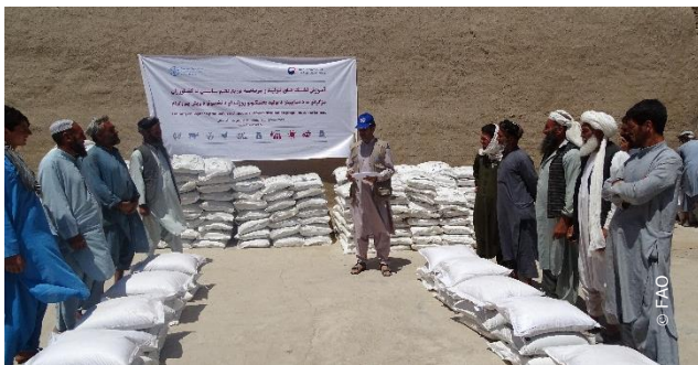
Distribution of soybean seed to the soybean farmers in Pashtonzerghon, Herat.

Therefore to improve households' food security and nutrition, enhance access to different classes of soybean seed and cultivation technology to the small holder farmers as well as increase soybean production in Afghanistan, 300 households in Herat Province received 6.03 metric tonnes of soybean seed, 7.538 metric tonnes of DAP, 4.523 metric tonnes of Urea and 0.060 metric tonnes of Rhizobium inoculant.