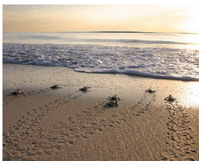
Sea turtle hatchlings.

With this information, fishermen are able to make decisions on where to deploy their fishing gear to reduce their risk of interacting with sea turtles.