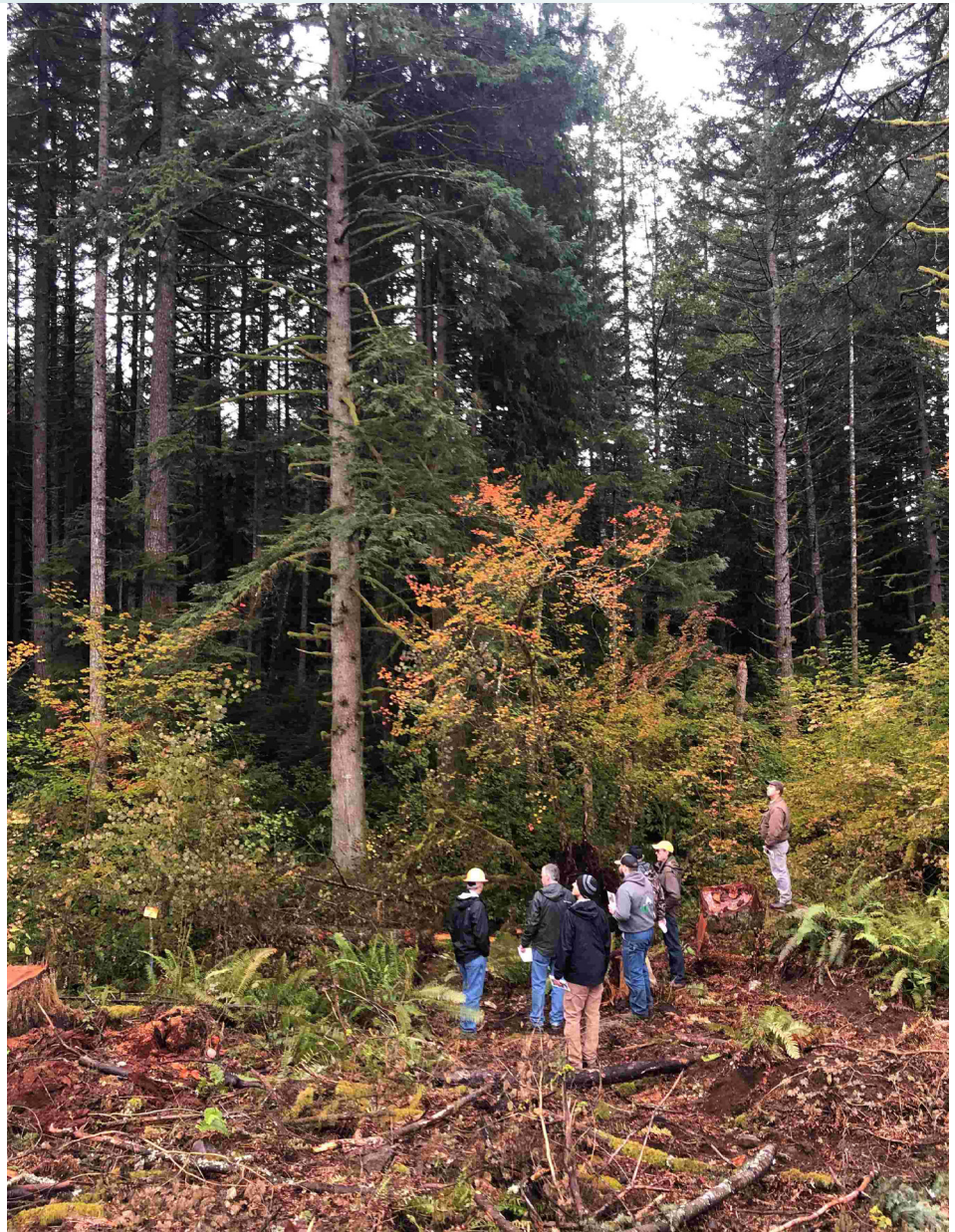
NOAA Fisheries biologists work with Port Blakely to identify improvements that would benefit protected species including Chinook and coho salmon and steelhead.

chain, detect seafood fraud and mislabeling, and enforce import regulations.