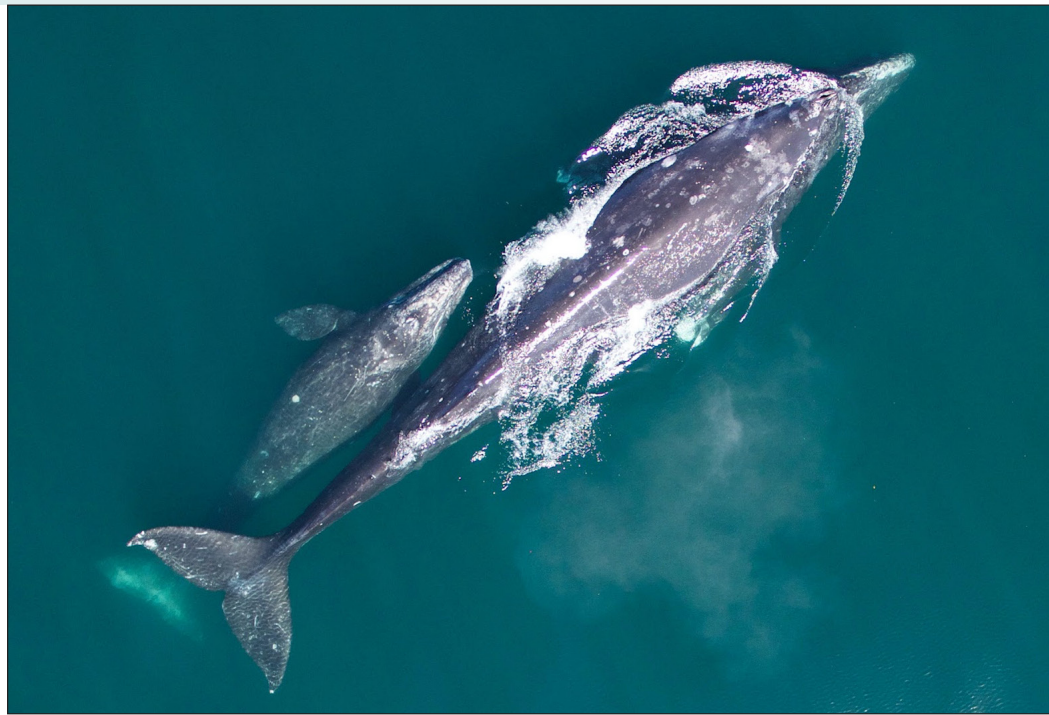
A gray whale mother-calf pair migrating along the central California coast from the wintering grounds in Mexico to the summer feeding grounds in the Arctic. SWFSC scientists collect data on eastern North Pacific gray whale abundance, calf production, and body condition to assess the health and status of the population.

regain ecological functions for protected species.