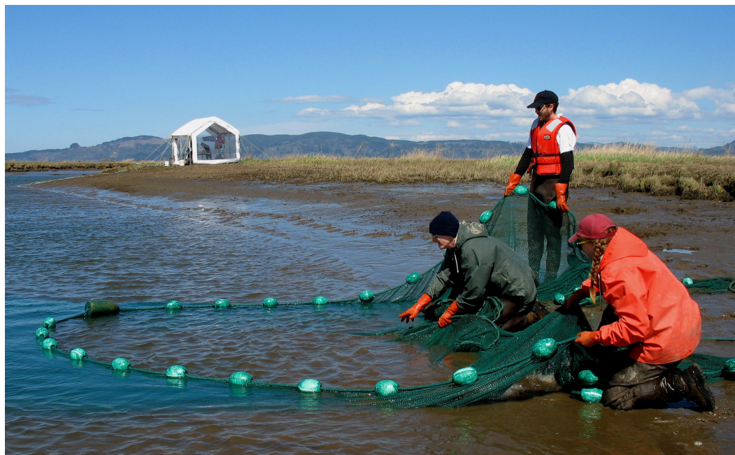
Beach Seining at Russian Island near Astoria, Oregon.