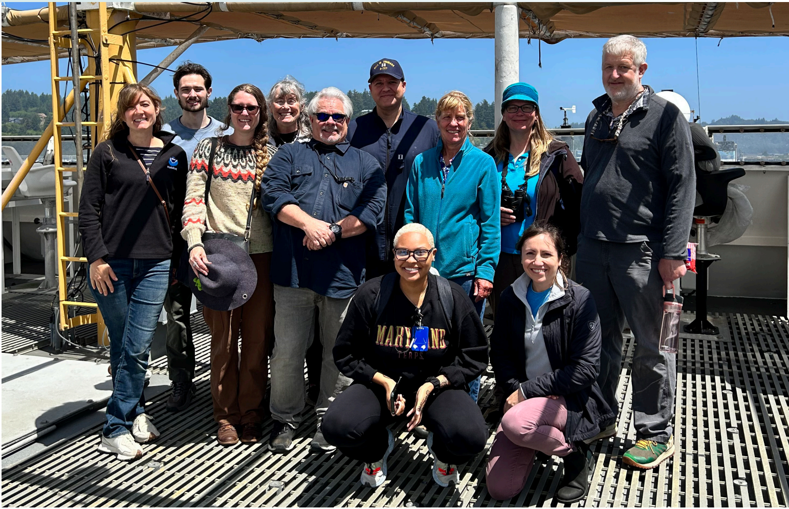
Staff from the West Coast Regional Office and Restoration Center tour the NOAA Fisheries Survey Vessel Bell M. Shimada as part of growth and learning opportunity.