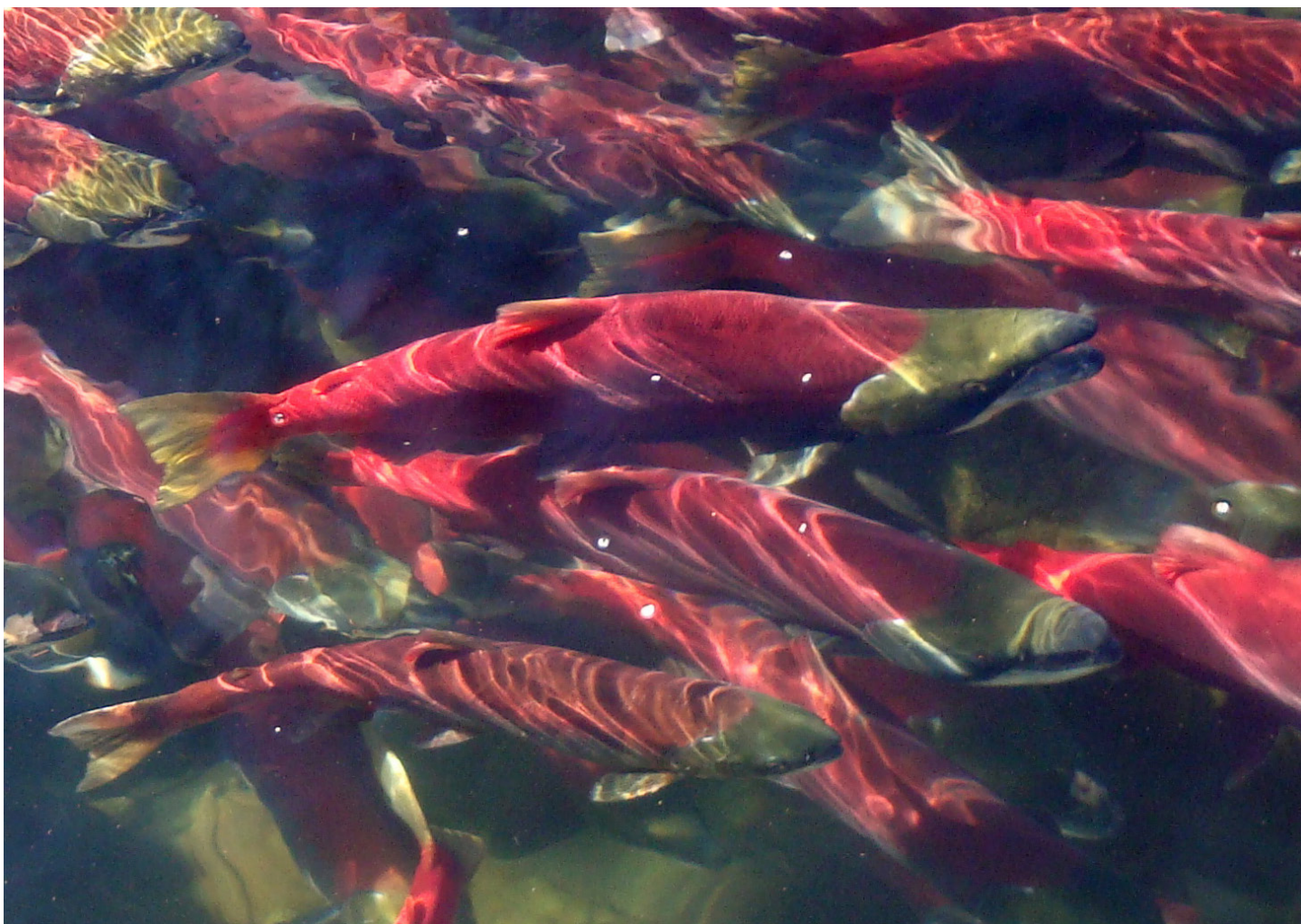
Sockeye salmon.

Along the West Coast, we manage the fisheries for salmon and steelhead, more than 90 species of groundfish, coastal pelagics such as anchovy and sardine, and highly migratory species such as billfish, sharks, and tunas. Fishing the Pacific lifts spirits, feeds families, and supports the economies of California, Oregon, Washington, and Idaho. The region harvests close to 1 billion pounds of seafood, worth nearly $1 billion, each year.