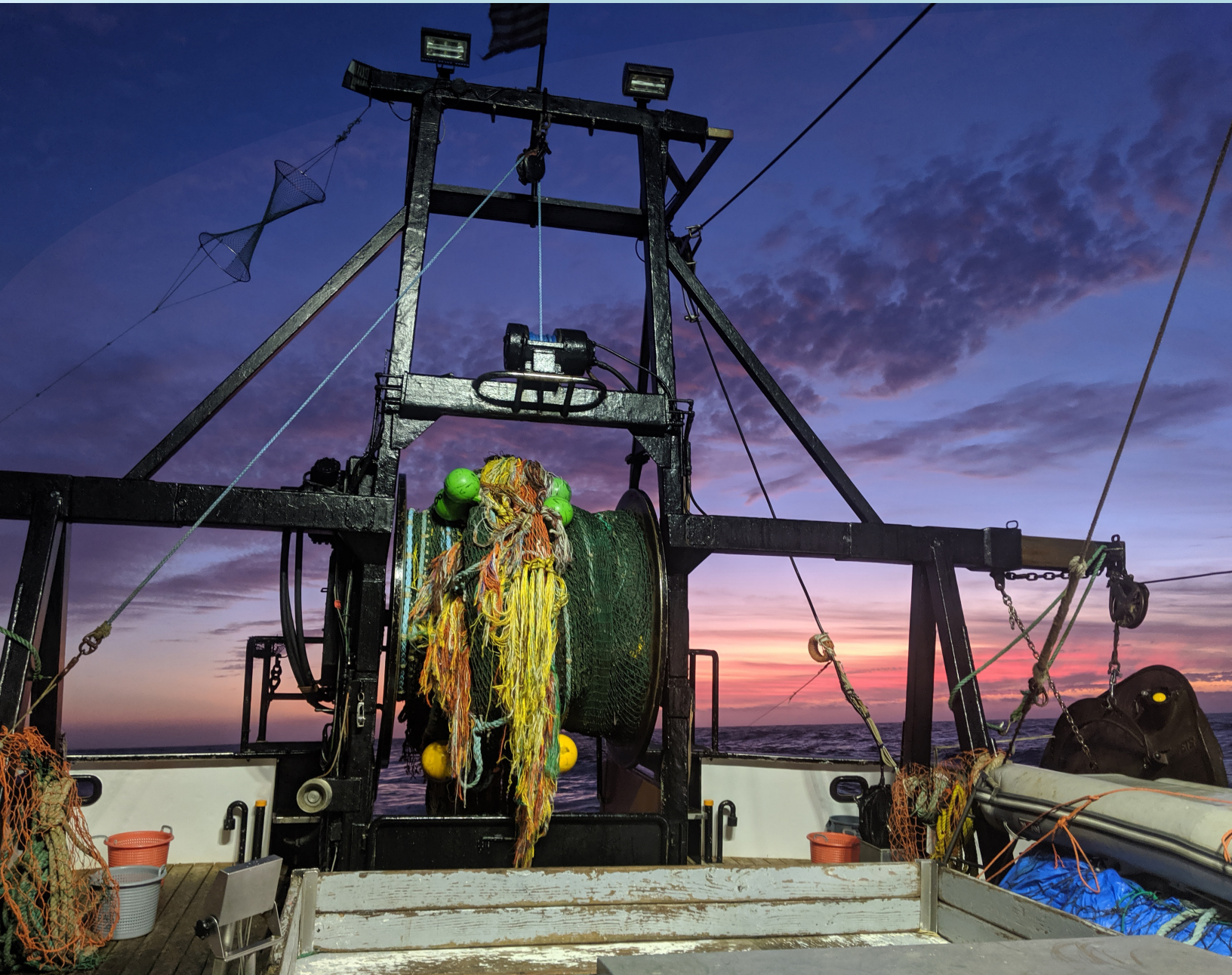
Cover: Pacific salmon spawning ground. Credit: NOAA Fisheries. Above: The West Coast Bottom Trawl Survey is a key source of fishery-independent data used for stock assessments and groundfish management. Credit: NOAA Fisheries.