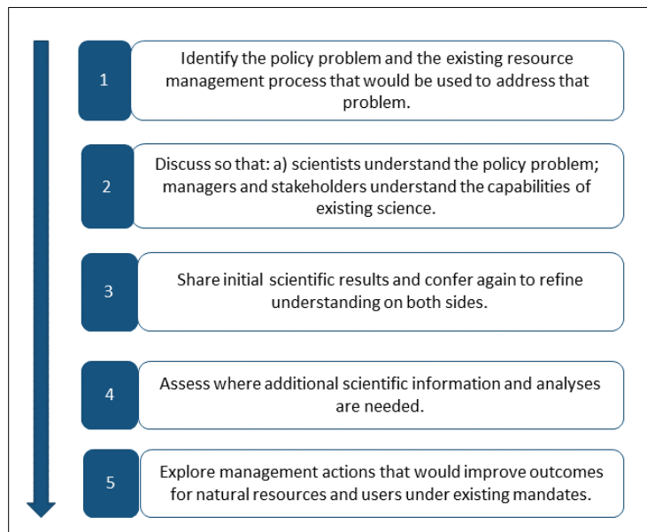
Figure 2: Outline of the steps for incorporating information for ecosystem models into management, adapted from Townsend et al. 2020.

NOAA Fisheries’ teams identified in Goal 1.c can assess and articulate regional decision-makers’ ecosystem and climate science needs (including ecological, social, and economic components), and develop science plans to address those needs in coordination with other efforts such as IEA, CEFI, and protected resources and habitat programs. For each science need identified, managers and scientists should ensure the decision-making process provides a clear on-ramp for using the scientific information. NOAA Fisheries will work internally and with external management partners to co-develop new management on-ramps when they do not exist. Direct engagement between scientists and management partners will ensure that scientists understand the policy questions addressed by managers, and ensure that staff and management partners understand the benefits and limits of NOAA Fisheries’ best available ecosystem and climate science (Townsend et al. 2020, see Figure 2).