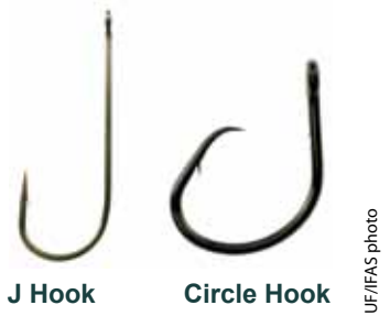
J Hook Circle Hook