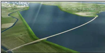
Inlet of the bypass (bottom), and the IJssel River (top) with city of Kampen in background.