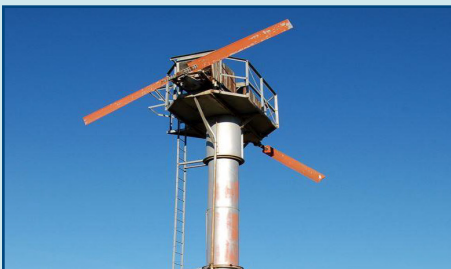
A frost fan used to prevent or minimize damage to vineyard crops by frost events.