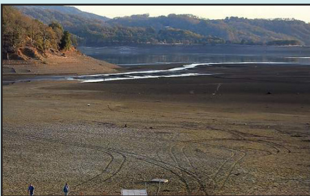
Lake Mendocino during the 2013 drought.