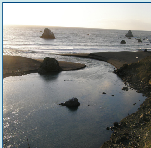
The mouth of the Russian River Estuary.