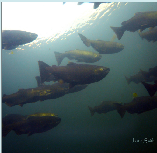
Russian River Chinook salmon.