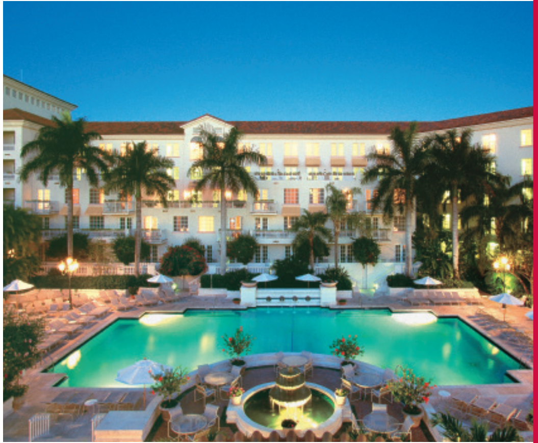
TURNBERRY ISLE RESORT, AVENTURA. JMBM’s Global Hospitality Group® represented the owner of this iconic resort — in designing and executing a successful strategy to terminate a top luxury brand’s management contract and remove the branded operator from the property. The contract had 50 years left to run. The victory included winning a Federal Court decision upholding our interpretation of applicable legal principles superseding the contract terms. The operator’s suit to regain control of the hotel was soundly defeated on all grounds.

It is always best to start out with the right brand and operator for your hotel ... and an agreement with fair terms you can live with. But when you don’t have that advantage and the situation becomes unbearable, what can you do as an owner to renegotiate or terminate a long-term, “no-cut” management agreement?