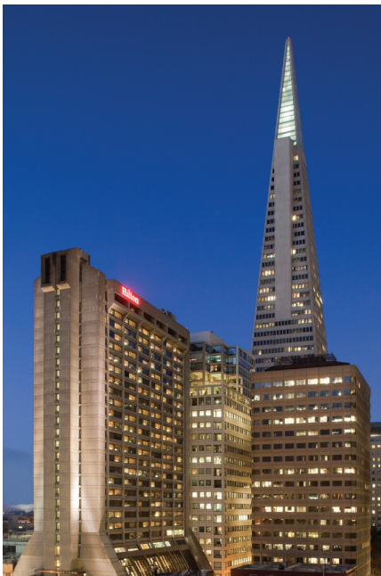
HILTON SAN FRANCISCO FINANCIAL DISTRICT. During a protracted city-wide strike, we successfully negotiated the only labor contracts in the City with this hotel's various unions. We have also served as general counsel to the owner on virtually all legal matters including branding, management, financing, land use and entitlements, and ownership structure issues.

To encourage a productive workforce and help minimize litigation, our hotel labor and employment lawyers stress a proactive approach to prevent problems. But when potential litigation arises, our clients receive our immediate attention. Whether it is a wage and hour lawsuit, claims of sexual harassment or discrimination, employee terminations or workplace violence, we respond quickly and aggressively.