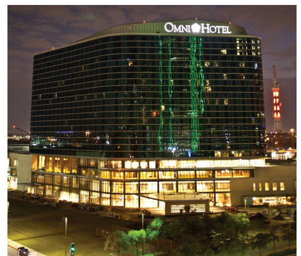
OMNI DALLAS CONVENTION CENTER HOTEL. The City of Dallas hired us to conduct a request for proposal (using JMBM’s HMA PRO™ approach) for hotel brands to manage this large, convention center hotel. We assisted in the selection process and then negotiated a “qualified hotel management agreement” meeting the requirements of the Internal Revenue Code for a project financed with tax-exempt bonds.

Although most hotel management agreements are “one-off” deals, we have handled a number of portfolio transactions. The photos here are representative of the 27-hotel portfolio owned by Lodgian and its private equity fund owner. We helped them select 6 operators and complete hotel management agreements for all 27 franchised hotels in 17 states using JMBM’s HMA PRO™ process.