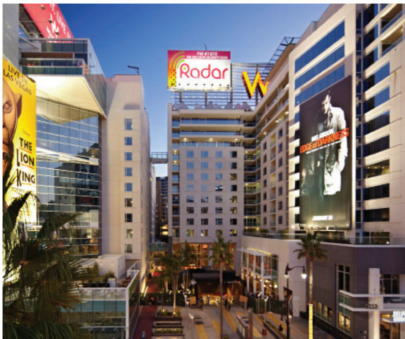
W HOTEL, HOLLYWOOD. We worked on many aspects of this mixed-use hotel property, including land use, almost $300 million of senior debt and mezzanine financing for development, and EB-5 financing for the Drai's Vegas-style night club and the Delphine fine-dining restaurant at the hotel.

Because of our expertise and leadership in hospitality lending, we regularly represent lenders on their hotel loans. The properties shown here are representative of some of the smaller loans we have handled. We also handle financing for larger, more complex properties and resorts, domestically and internationally, and portfolios, including many hotels in the brand families of Hilton, Intercontinental, Marriott (including Starwood), Hyatt, Best Western and Choice. Some high-profile lending work includes the W Hollywood, Four Seasons Scottsdale, Four Seasons Aviara, Ritz-Carlton Highlands, Marriott Renaissance Las Vegas, and many more.