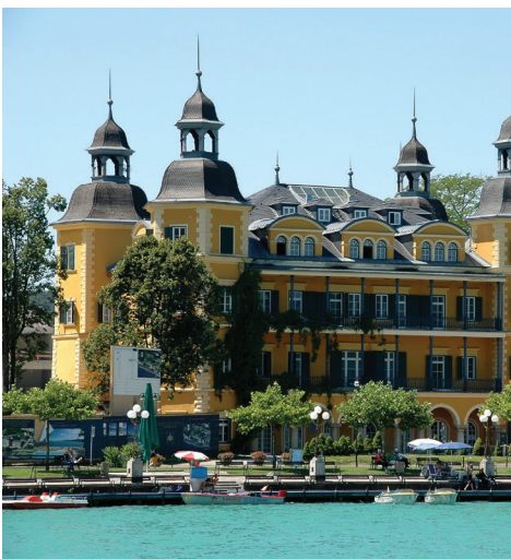
SCHLOSS HOTEL VELDEN, AUSTRIA. Built circa 1590, Schloss Hotel Velden has long been a preferred destination of the international jet set, royalty, dignitaries, movie stars and writers. We assisted the European lender in terminating a long-term hotel management agreement with a luxury brand operator without cost or payment to the operator.

Clients look to us as strategic advisors to assist in answering these questions and more. We develop and execute the “critical game plan.” We understand how to identify and work with the strengths and vulnerabilities of each player in the capital stack — whether that means maximizing a creditor’s recovery, protecting the owner’s assets, reorganizing a viable business or providing asset acquisition and recapitalization strategies for opportunistic buyers.