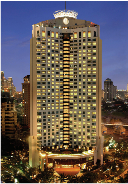
INTERCONTINENTAL, JAKARTA. JMBM assisted the owner of this landmark Jakarta hotel in terminating a long-term, no-cut, management agreement with a top luxury brand, selecting a new operator and rebranding the hotel as the InterContinental Midplaza.

When they tell you that something is a “standard practice,” we might tell you something different.