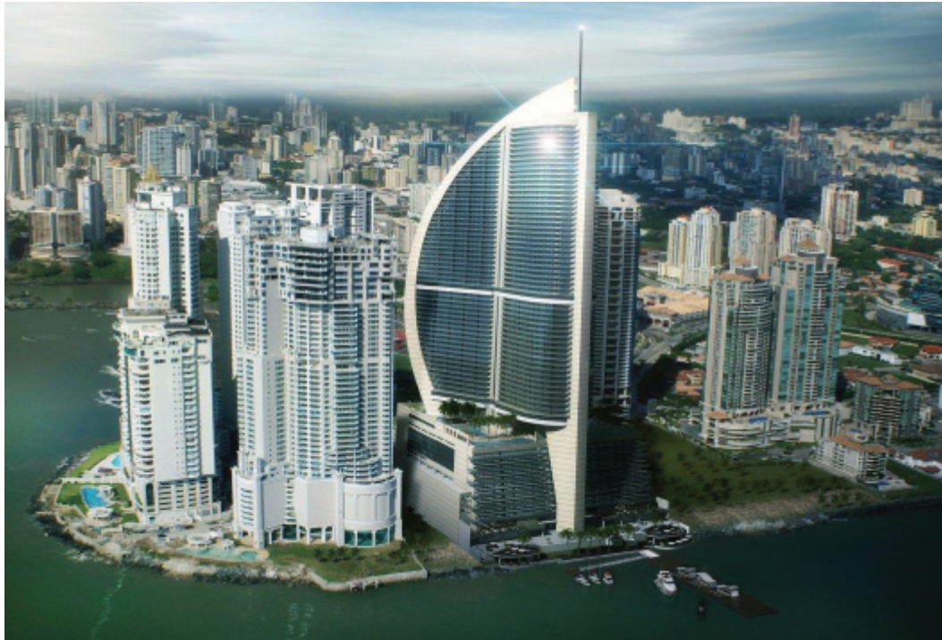
TRUMP OCEAN CLUB INTERNATIONAL HOTEL & TOWER, PANAMA CITY. Luxury hotels like this often provide the spark plug to energize and create value with high-end mixed-use for hotel-anchored residential, condo hotel, retail and office projects. We have represented the Trump Organization and other clients on more than 100 hotel mixed-use projects throughout the U.S., Latin America, the Caribbean, Asia and Europe.

Urban mixed-use can be the most challenging and rewarding of all development projects. Studies have shown that the right hospitality elements combined with the right mix of retail, office, residential, hotel, fractional, spa, and entertainment components can enhance the value of the other elements in a mixed-use project by 34% or more and allow more attractive financing. By adding a hotel or other hospitality elements to an urban environment, a dynamic and sophisticated set of opportunities and challenges comes into play.