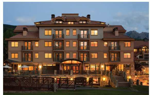
FAIRMONT SONOMA MISSION INN, SONOMA. We have assisted many lenders and special servicers with troubled assets — more than 1,000 workouts, bankruptcies, receiverships and recapitalizations. Representative clients include Wells Fargo Bank, JP Morgan Chase Bank, Union Bank, HSH Nordbank AG, HSBC Bank USA, and Lehman Brothers, Inc. Special servicer clients include Midland Loan Services (represented on this Fairmont Sonoma Mission Inn), Berkadia Commercial Mortgage, Helios AMC and ORIX Capital Markets.

Clients look to us as strategic advisors to assist in answering these questions and more. We develop and execute the “critical game plan.” We understand how to identify and work with the strengths and vulnerabilities of each player in the capital stack — whether that means maximizing a creditor’s recovery, protecting the owner’s assets, reorganizing a viable business or providing asset acquisition and recapitalization strategies for opportunistic buyers.