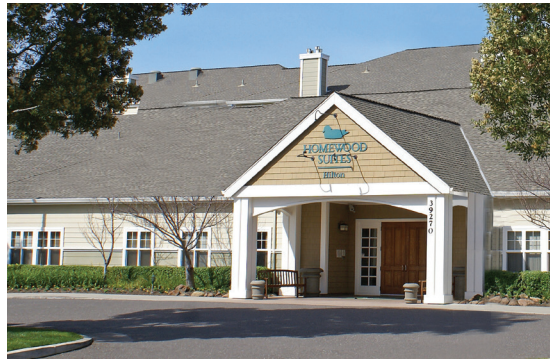
HOMWOOD SUITES HILTON, NEWARK.

We are a major gateway of hotel finance – the bridge between providers and consumers of capital. We facilitate the flow of capital with our legal expertise and hospitality industry knowledge.