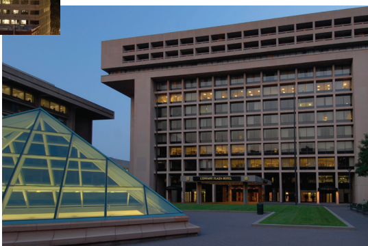
L'ENFANT PLAZA HOTEL, WASHINGTON D.C. We represent many hotel owners and operators nationwide on their labor matters, such as the collective bargaining agreement for the L'Enfant Plaza Hotel.