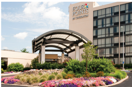
FOUR POINTS, PHILADELPHIA.

And of course, there are many luxury properties and world-class resorts we have worked on too, like the Ritz-Carlton Bali, Four Seasons Maui, Las Ventanas, The Boulders, and Turnberry Resort & Spa.