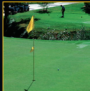
Golf & Country Clubs