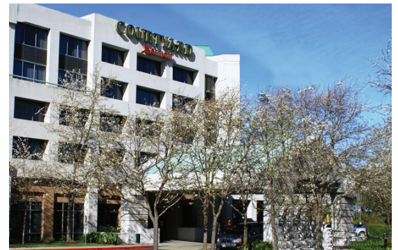
COURTYARD BY MARRIOTT, RICHMOND.