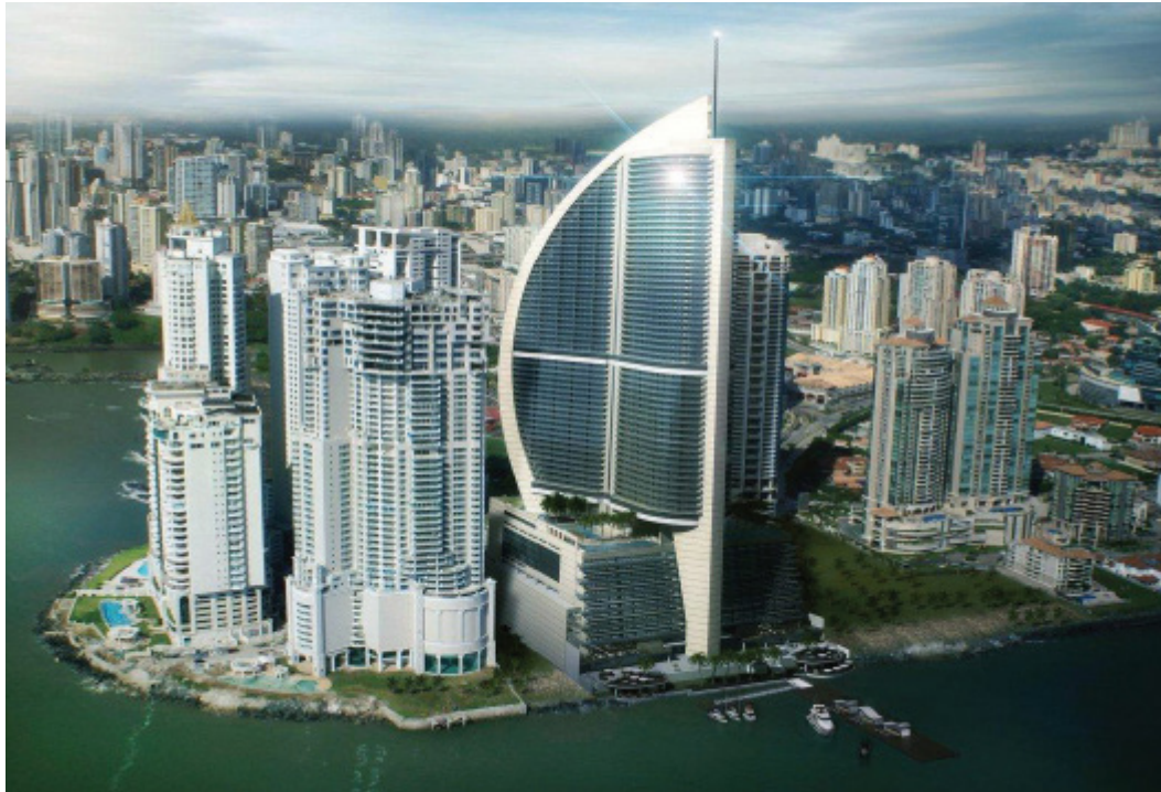
TRUMP OCEAN CLUB INTERNATIONAL HOTEL & TOWER, PANAMA CITY. Luxury hotels like this often provide the spark plug to energize and create value with high-end mixed-use for hotel-anchored residential, condo hotel, retail and office projects. We have represented the Trump Organization and other clients on more than 100 hotel mixed-use projects throughout the U.S., Latin America, the Caribbean, Asia and Europe.

Urban mixed-use can be the most challenging and rewarding of all development projects. Studies have shown that the right hospitality elements combined with the right mix of retail, office, residential, hotel, fractional, spa, and entertainment components can enhance the value of the other elements in a mixed-use project by 34% or more and allow more attractive financing. By adding a hotel or other hospitality elements to an urban environment, a dynamic and sophisticated set of opportunities and challenges comes into play.