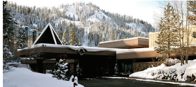
RESORT AT SQUAW CREEK, SQUAW VALLEY. We help owners of single hotels, portfolios and national chains develop a proactive approach to accessibility compliance and challenges, as we did for the owner of this prestigious ski resort.

Representative clients for single property and national, system-wide accessibility audits and compliance matters include Red Lobster, Olive Garden, Extended Stay America, Motel 6 (G6), Strategic Hotels, Best Western, Kimpton Hotels & Restaurants, Joie de Vivre Hotels, Rock Bridge Capital, JPMorgan Chase Bank, Wells Fargo Bank, The Limited, Best Buy, Victoria’s Secret, PG&E, Bed Bath & Beyond of California, Inc., CIM Group, Inc., Union Bank, City National Bank, Relax the Back, City OF Santa Clara, The Honda Center, SAP Center and the City and County of San Francisco. Our engagements range from a single location bed and breakfast to chain-wide compliance for a 6,000-property chain.