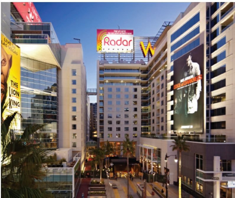
W HOTEL, HOLLYWOOD. We worked on many aspects of this mixed-use hotel property, including land use, almost $300 million of senior debt and mezzanine financing for development, and EB-5 financing for the Drai's Vegas-style night club and the Delphine fine-dining restaurant at the hotel.

Because of our expertise and leadership in hospitality lending, we regularly represent lenders on their hotel loans. The properties shown here are representative of some of the smaller loans we have handled. We also handle financing for larger, more complex properties and resorts, domestically and internationally, and portfolios, including many hotels in the brand families of Hilton, Intercontinental, Marriott (including Starwood), Hyatt, Best Western and Choice. Some high-profile lending work includes the W Hollywood, Four Seasons Scottsdale, Four Seasons Aviara, Ritz-Carlton Highlands, Marriott Renaissance Las Vegas, and many more.