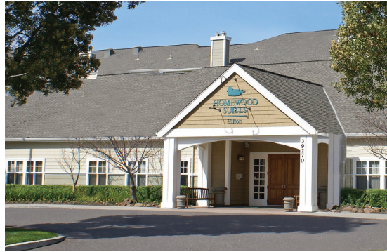
HOMWOOD SUITES HILTON, NEWARK.

We are a major gateway of hotel finance – the bridge between providers and consumers of capital. We facilitate the flow of capital with our legal expertise and hospitality industry knowledge.