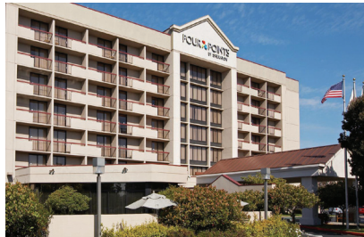
FOUR POINTS SHERATON, EMERYVILLE.