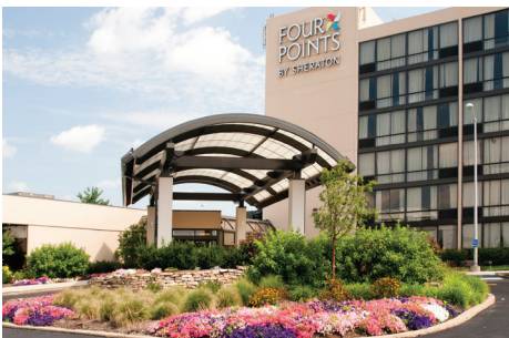
FOUR POINTS, PHILADELPHIA.

And of course, there are many luxury properties and world-class resorts we have worked on too, like the Ritz-Carlton Bali, Four Seasons Maui, Las Ventanas, The Boulders, and Turnberry Resort & Spa.