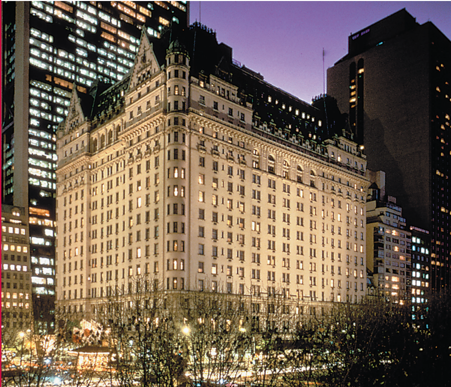
THE PLAZA, NEW YORK CITY. We have performed hotel management agreement work on some of the most iconic hotels in the world, such as The Plaza, Hilton Anatole, Hilton San Francisco, Omni Dallas Convention Center, InterContinental Jakarta, Regent Hong Kong, Trump Panama and the Schloss Velden Austria.

Our business and legal experience from more than 2,800 hotel management agreements provides the largest virtual database of hotel management and franchise agreement terms in the world.