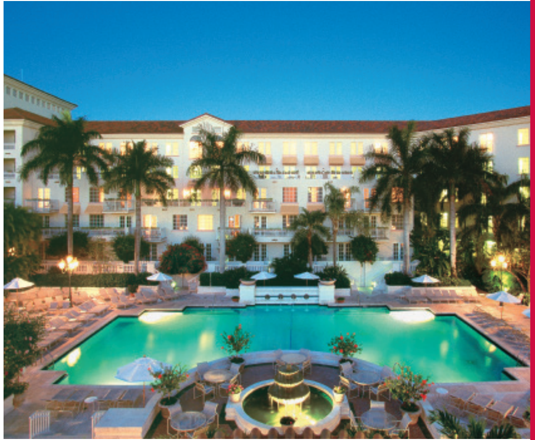
TURNBERRY ISLE RESORT, AVENTURA. JMBM’s Global Hospitality Group® represented the owner of this iconic resort — in designing and executing a successful strategy to terminate a top luxury brand’s management contract and remove the branded operator from the property. The contract had 50 years left to run. The victory included winning a Federal Court decision upholding our interpretation of applicable legal principles superseding the contract terms. The operator’s suit to regain control of the hotel was soundly defeated on all grounds.

It is always best to start out with the right brand and operator for your hotel ... and an agreement with fair terms you can live with. But when you don’t have that advantage and the situation becomes unbearable, what can you do as an owner to renegotiate or terminate a long-term, “no-cut” management agreement?