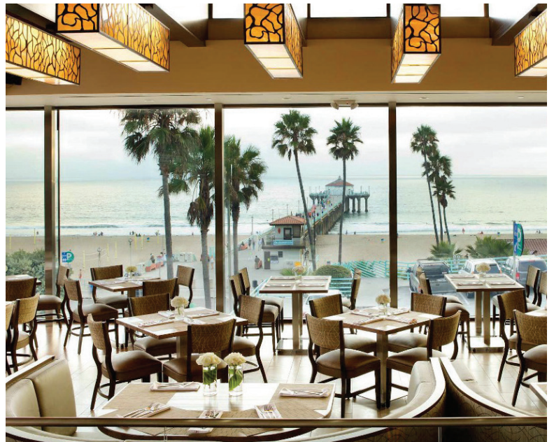
THE STRAND HOUSE, MANHATTAN BEACH. We provided a range of legal services for this restaurant, including acquisition and leasing, structuring a joint venture, procuring a liquor license and resolving land use issues relating to its unique beachfront setting.