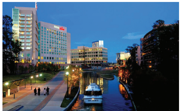
THE WOODLANDS, TEXAS. The Woodlands project, one of the largest hotel mixed-use developments in the United States, demonstrates how each component of a hotel mixed-use project enhances the other. Residential elements fetch higher prices and rents, retail and restaurants generate more sales, and hotels achieve significantly higher revenue per available room (RevPAR).

We can also help you assemble your hospitality development team with experienced and successful team members to optimize everything from entitlements, architecture, construction and banking to management, marketing, financing and more — from conception through opening and then into ongoing operations.