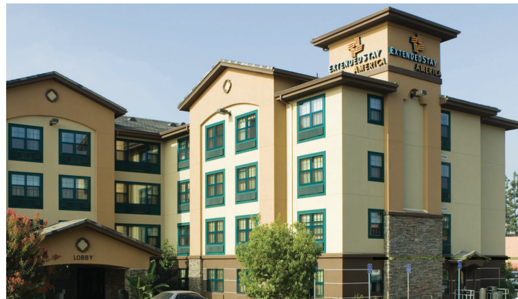
EXTENDED STAY AMERICA, SACRAMENTO. We have performed system-wide accessibility audits for Extended Stay America hotels (including prototype plan checking), and have assisted them nationally with proactive and defensive ADA and related accessibility compliance matters.