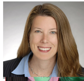
Sher Bonstele Litigation