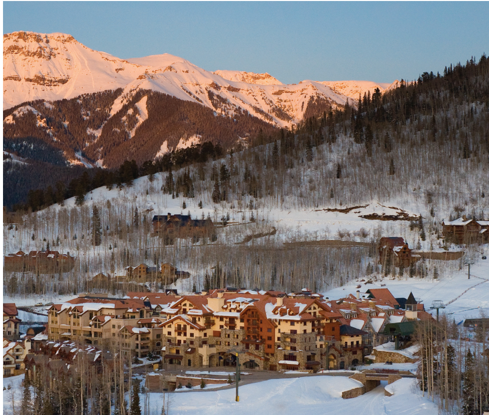
HOTEL MADELINE, TELLURIDE. Our hotel lawyers represented a European bank in maximizing recovery on a $156 million loan secured by a luxury hotel mixed-use property (with residential and retail) operated by a top luxury brand. Our strategies resulted in the lender taking possession of the hotel and other mixed-use assets, while avoiding liability under an SNDA and terminating the long-term hotel management agreement. Termination of the management agreement immediately added at least $41 million of value to the property.