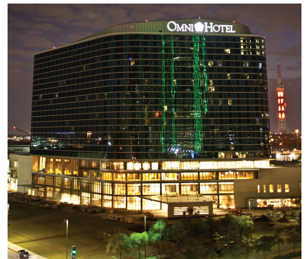
OMNI DALLAS CONVENTION CENTER HOTEL. The City of Dallas hired us to conduct a request for proposal (using JMBM’s HMA PRO™ approach) for hotel brands to manage this large, convention center hotel. We assisted in the selection process and then negotiated a “qualified hotel management agreement” meeting the requirements of the Internal Revenue Code for a project financed with tax-exempt bonds.

Although most hotel management agreements are “one-off” deals, we have handled a number of portfolio transactions. The photos here are representative of the 27-hotel portfolio owned by Lodgian and its private equity fund owner. We helped them select 6 operators and complete hotel management agreements for all 27 franchised hotels in 17 states using JMBM’s HMA PRO™ process.