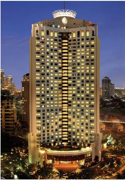
INTERCONTINENTAL, JAKARTA. JMBM assisted the owner of this landmark Jakarta hotel in terminating a long-term, no-cut, management agreement with a top luxury brand, selecting a new operator and rebranding the hotel as the InterContinental Midplaza.

When they tell you that something is a “standard practice,” we might tell you something different.