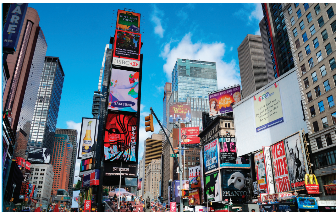
TIMES SQUARE, NEW YORK CITY. We have defended more than 750 ADA and related accessibility claims for owners of hotels, restaurants, spas, wineries, performing arts theaters, and other commercial real estate. In this case, our international hotel owner-operator client hired us for national representation in ADA and accessibility matters, including the defense of the high profile Department of Justice ADA compliance “sweep” of more than 50 hotels in Manhattan’s Times Square entertainment district.

Being ADA-friendly is good business. Accessibility compliance is the law. And it is much cheaper to be proactive on accessibility issues than to defend lawsuits.