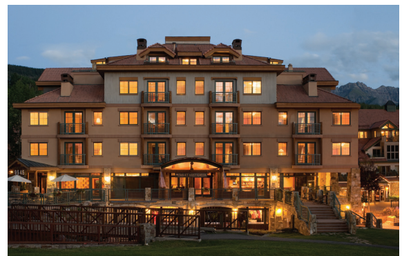
FAIRMONT SONOMA MISSION INN, SONOMA. We have assisted many lenders and special servicers with troubled assets — more than 1,000 workouts, bankruptcies, receiverships and recapitalizations. Representative clients include Wells Fargo Bank, JP Morgan Chase Bank, Union Bank, HSH Nordbank AG, HSBC Bank USA, and Lehman Brothers, Inc. Special servicer clients include Midland Loan Services (represented on this Fairmont Sonoma Mission Inn), Berkadia Commercial Mortgage, Helios AMC and ORIX Capital Markets.

Clients look to us as strategic advisors to assist in answering these questions and more. We develop and execute the “critical game plan.” We understand how to identify and work with the strengths and vulnerabilities of each player in the capital stack — whether that means maximizing a creditor’s recovery, protecting the owner’s assets, reorganizing a viable business or providing asset acquisition and recapitalization strategies for opportunistic buyers.