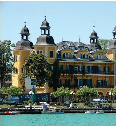
SCHLOSS HOTEL VELDEN, AUSTRIA. Built circa 1590, Schloss Hotel Velden has long been a preferred destination of the international jet set, royalty, dignitaries, movie stars and writers. We assisted the European lender in terminating a long-term hotel management agreement with a luxury brand operator without cost or payment to the operator.

Clients look to us as strategic advisors to assist in answering these questions and more. We develop and execute the “critical game plan.” We understand how to identify and work with the strengths and vulnerabilities of each player in the capital stack — whether that means maximizing a creditor’s recovery, protecting the owner’s assets, reorganizing a viable business or providing asset acquisition and recapitalization strategies for opportunistic buyers.