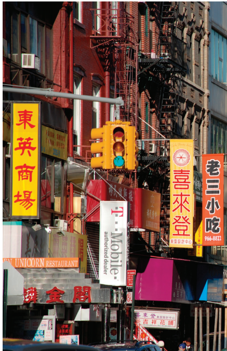
CHINATOWN, NEW YORK CITY. JMBM represented a wealthy Chinese family in multi-state federal court litigation against the New York hotel union, charging unlawful unionization of one of its hotels in Manhattan. The outcome stopped union organizing at all of the family's 8 New York City hotels.