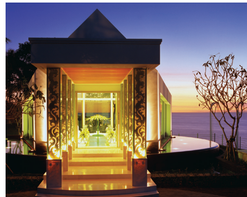
AYANA RESORT & SPA, BALI. As the Ritz-Carlton Bali, this fabulous resort arguably built the luxury chain’s resort brand in Asia. Our team negotiated critical management agreement amendments that ultimately enabled the owner to terminate the long-term, no-cut contract. We developed the strategy and filed the litigation that successfully ousted the luxury brand operator. We then assisted the owner in selecting a new luxury operator and negotiating an agreement that was much more favorable to the owner.

The right outcome can unlock millions of dollars of value.