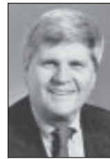
Minority Leader- Designate Dick Day

Prepared by Minnesota Senate Publications 325 Capitol St. Paul, MN 55155 (651) 296-0259