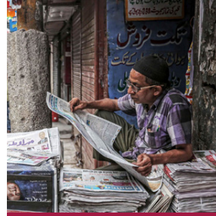
Earn a living