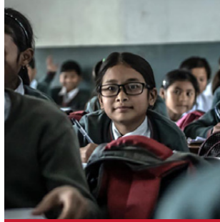
Get an education

Good vision and eye health unlocks people's potential to: