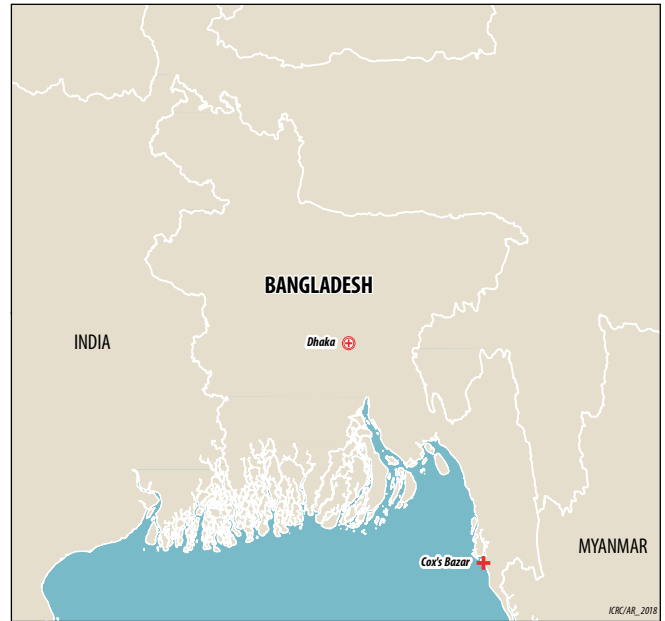
⊕ ICRC delegation + ICRC office