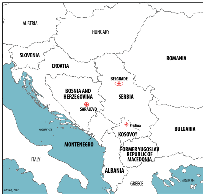
ICRC/AR_2017 ICRC regional delegation ICRC delegation ICRC mission *UN Security Council Resolution 1244

The boundaries, names and designations used in this report do not imply official endorsement, nor express a political opinion on the part of the ICRC, and are without prejudice to claims of sovereignty over the territories mentioned.