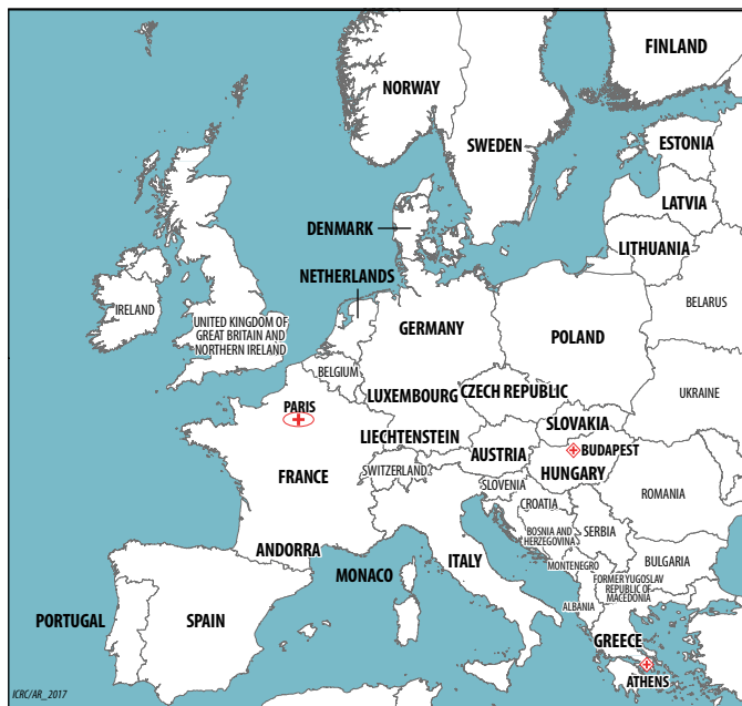
ICRC regional delegation ICRC mission

COVERING: Andorra, Cyprus, Czech Republic, Estonia, France, Greece, Hungary, Italy, Latvia, Lithuania, Luxembourg, Malta, Monaco, Netherlands, Portugal, Spain, Sweden (with specialized services for other countries)