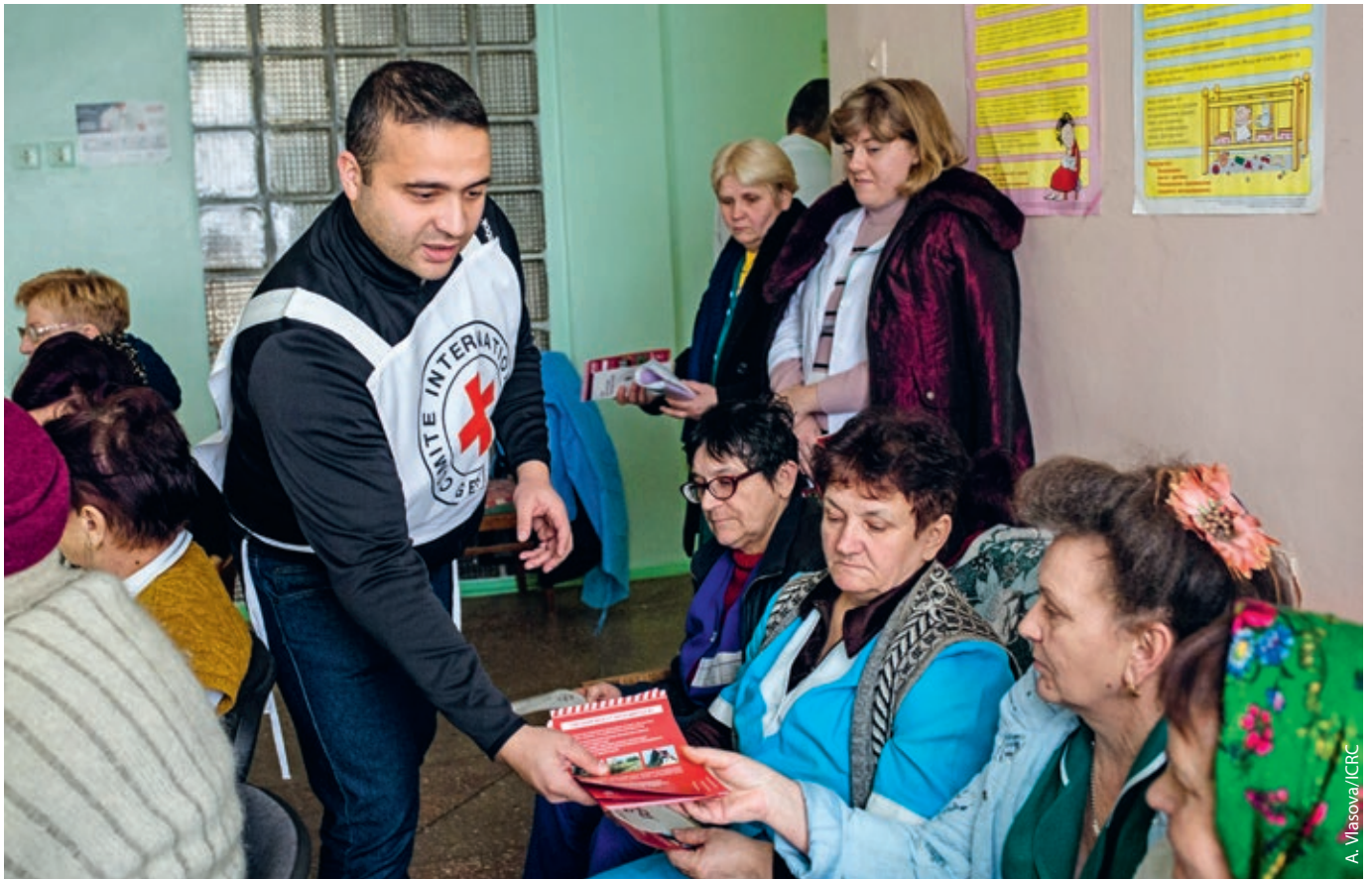
Ukraine, Donetsk area. At an ICRC briefing, hospital staff learn more about safe practices in areas contaminated with mines and explosive remnants of war.