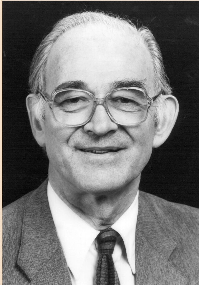
Bert Bolin (15 May 1925 – 30 December 2007)

The Working Group I contribution to the Fifth Assessment Report of the Intergovernmental Panel on Climate Change (IPCC) Climate Change 2013: The Physical Science Basis is dedicated to the memory of Bert Bolin, the first Chair of the IPCC.