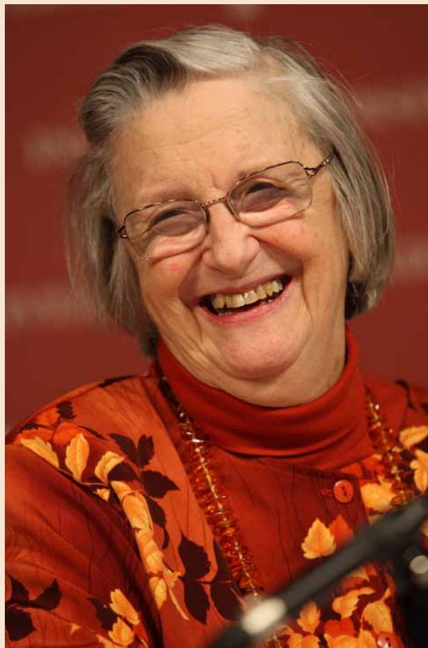
Elinor Ostrom (7 August 1933 – 12 June 2012)

We dedicate this report to the memory of Elinor Ostrom, Professor of Political Science at Indiana University and Nobel Laureate in Economics. Her work provided a fundamental contribution to the understanding of collective action, trust, and cooperation in the management of common pool resources, including the atmosphere. She launched a research agenda that has encouraged scientists to explore how a variety of overlapping policies at city, national, regional, and international levels can enable humankind to manage the climate problem. The assessment of climate change mitigation across different levels of governance, sectors and regions has been a new focus of the Working Group III contribution to AR5. We have benefited greatly from the vision and intellectual leadership of Elinor Ostrom.