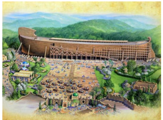
Artist's rendering of the Ark Encounter, a Noah's Ark-themed park planned for a site west of Interstate 75 near Williamstown, Ky.