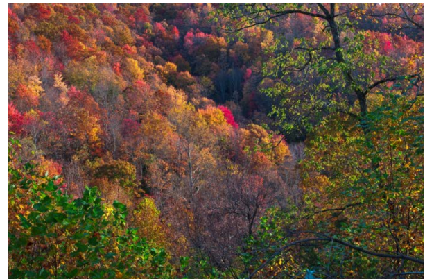
Forest canopy in fall color at Kentenia State Forest from overlook on Kentucky Highway 2010.

Don't forget to buy a nature license plate when you register your car, light truck or SUV!