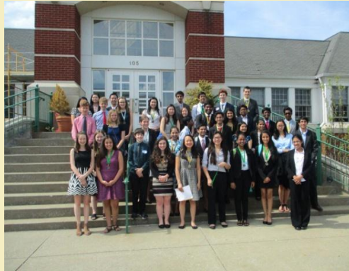
Pictured above are the 2017 Award Winners