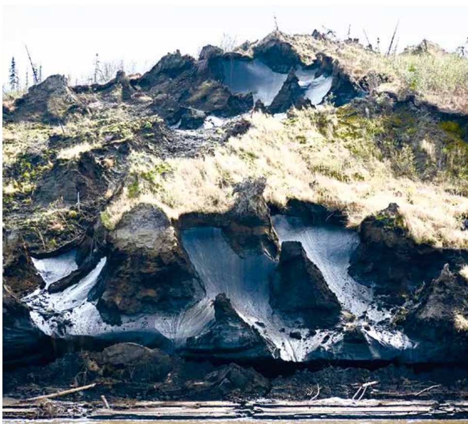
Eroding permafrost cliffs: the soil on the banks of the Kolyma River slides over the still-frozen layers, carrying organic material with it, which then gets washed away by the river. Much of it decomposes, releasing carbon dioxide.