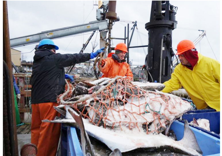
Fishermen unload halibut catch.

Acute health effects associated with marine pathogens and HAB toxins are estimated to cost almost $1 billion per year. Improved ecological forecasts will provide more time for decision-making and mitigation efforts, reducing both the costs and effects of HAB events. OCX data will also aid better predictions of when conditions will return to normal, allowing decision-makers to lift beach and fisheries closures as quickly and safely as possible.