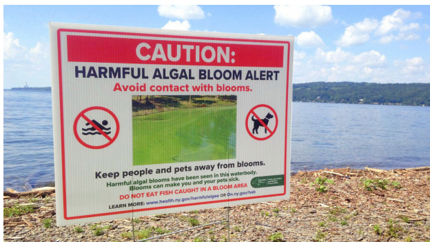
Taughannock Falls State Park in New York closed swimming area closure due to toxic algae outbreak.

OCX observations will support ecological forecasters, marine resource managers, fisheries, health departments, water treatment managers, and the commerce, recreation, and tourism industries.