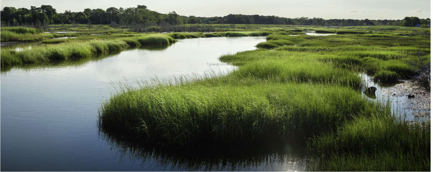
Marsh in Massachusetts