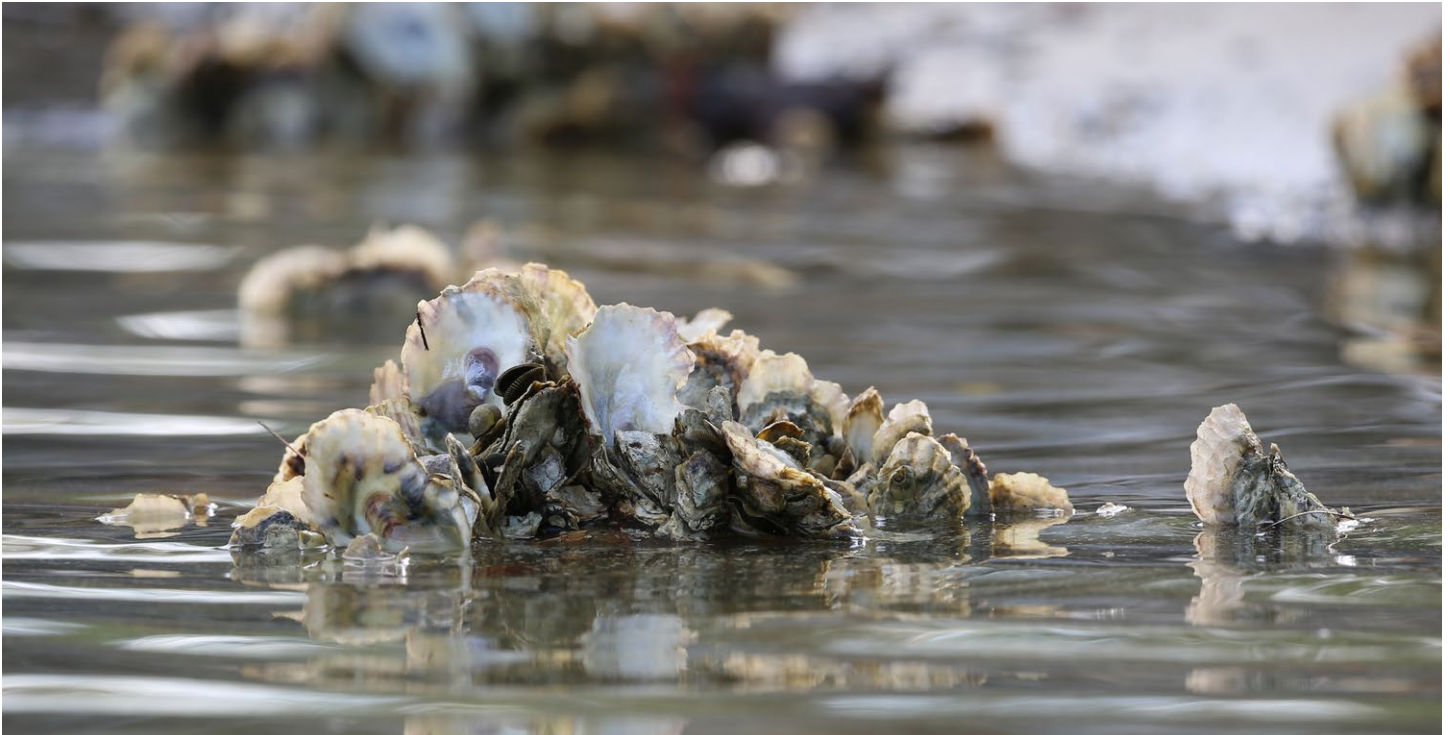
Oysters in Virginia