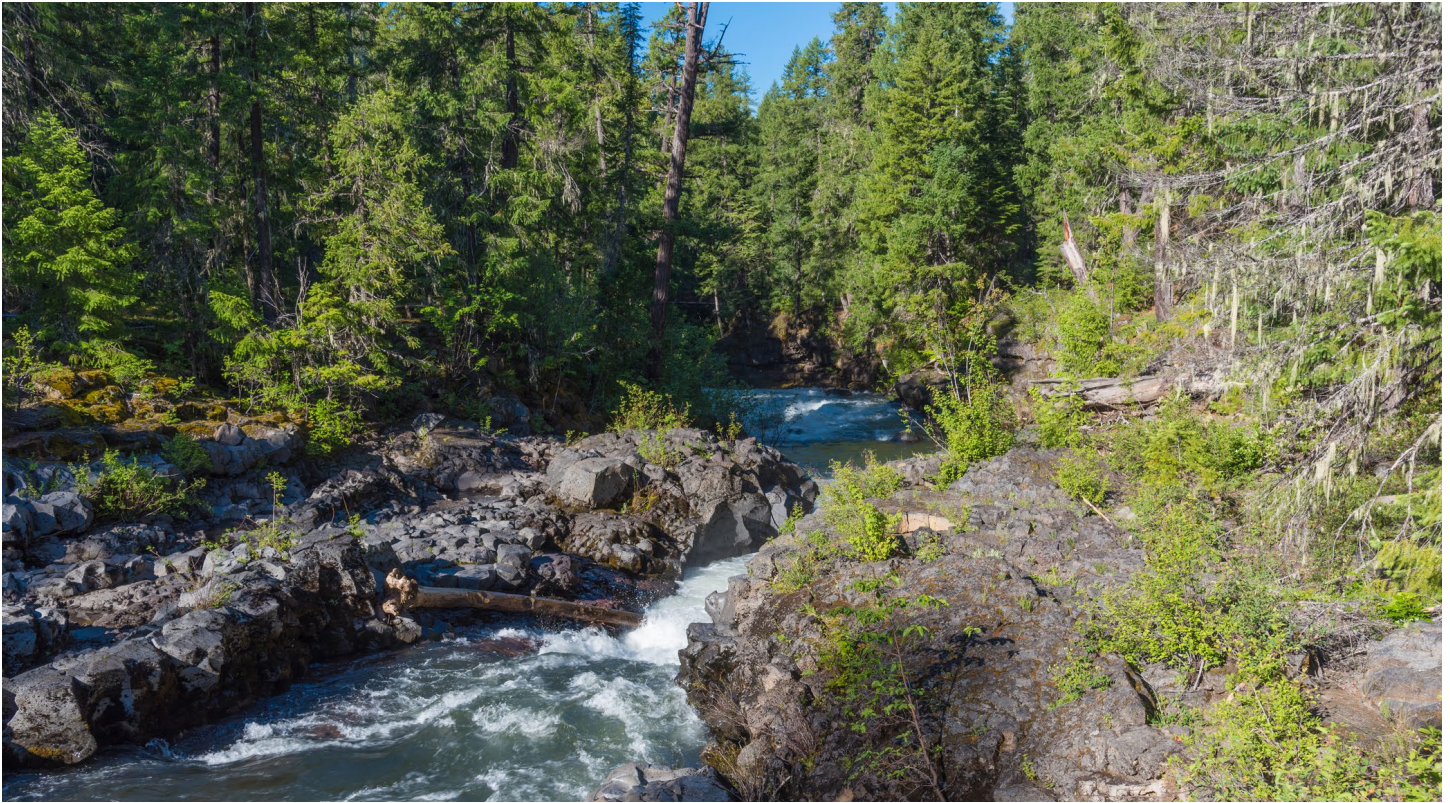
Stream running through a forest in southern Oregon