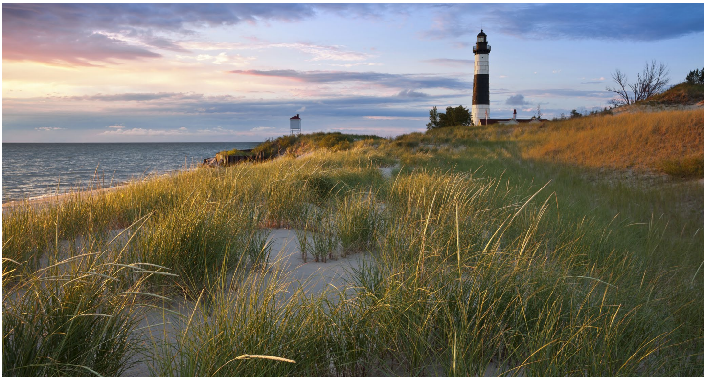
Big Sable Point Lighthouse on the Lake Michigan shoreline in Michigan