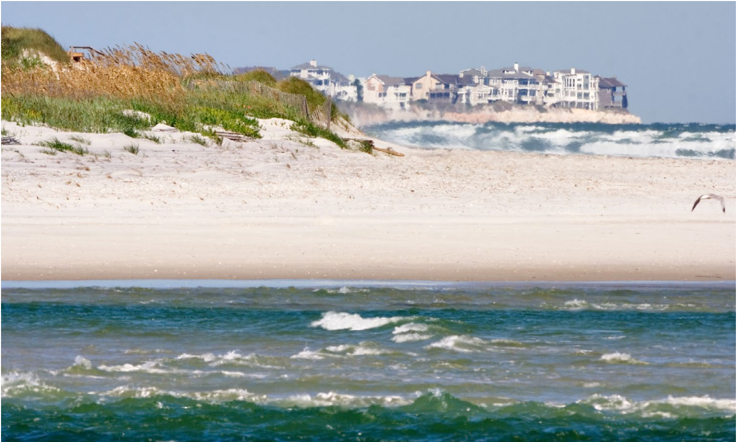
Homes and dunes in North Carolina