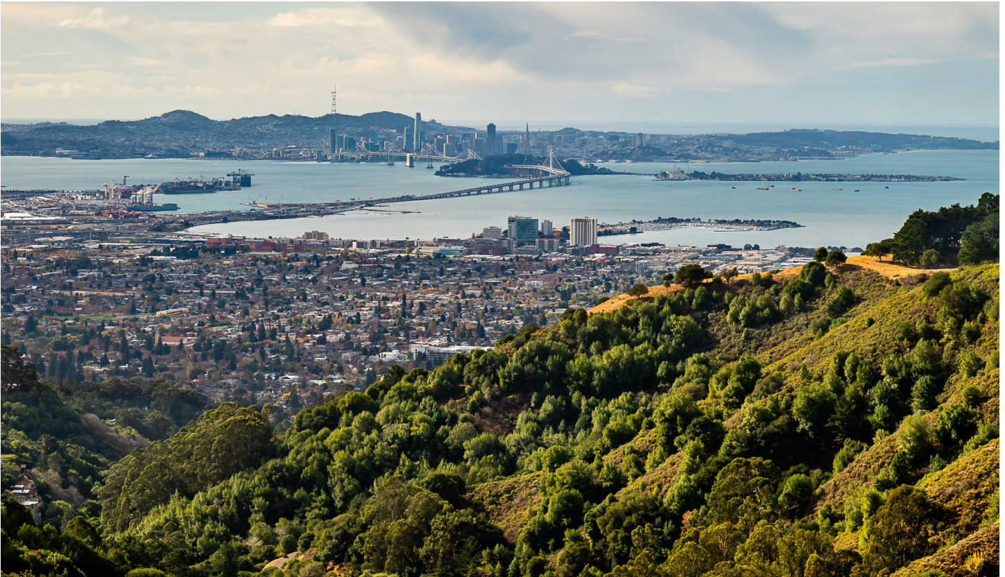
San Francisco Bay