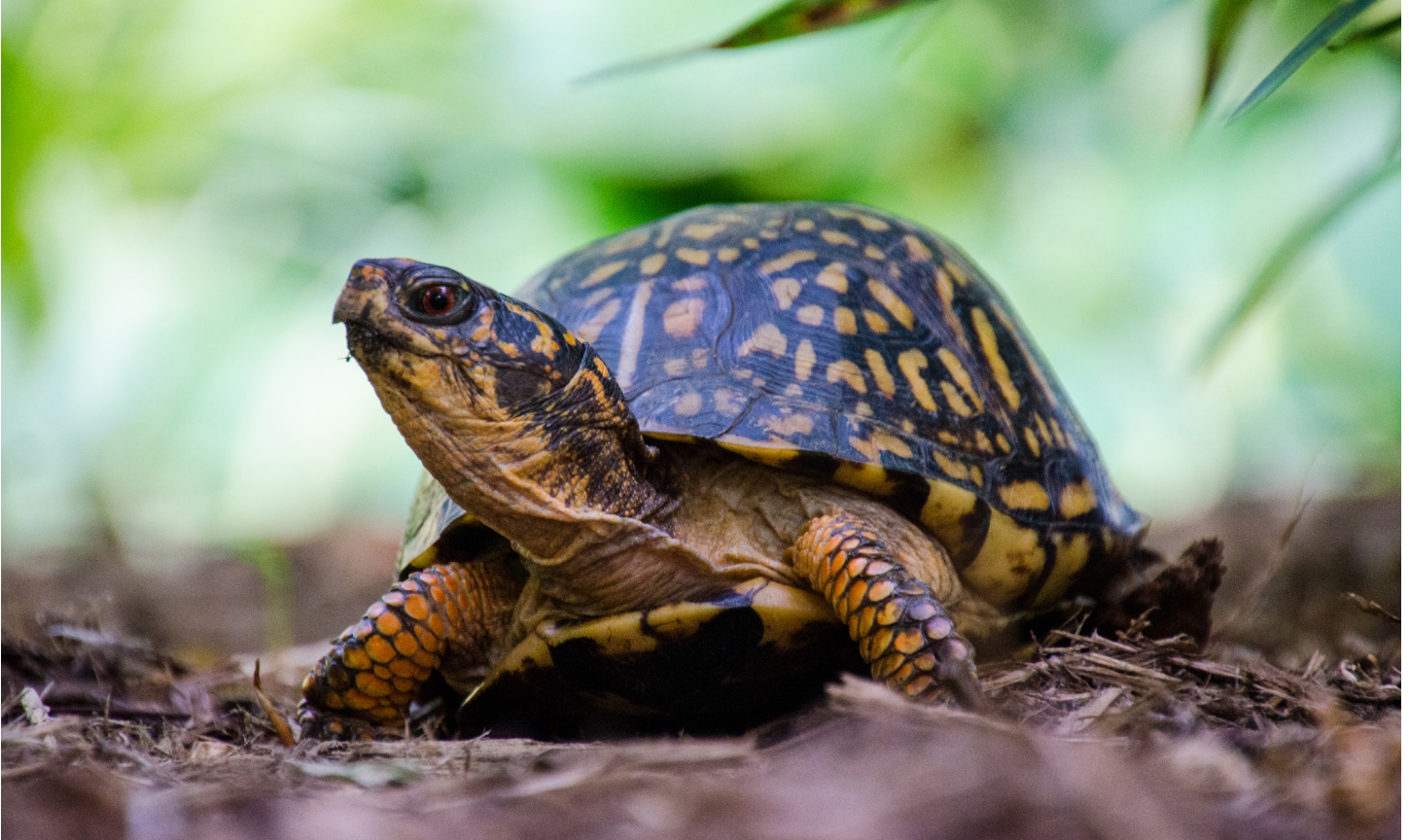
Eastern box turtle