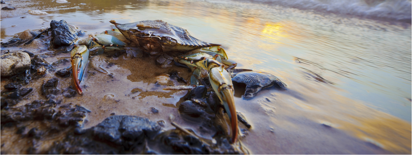
Blue crab on Chesapeake Bay, Maryland