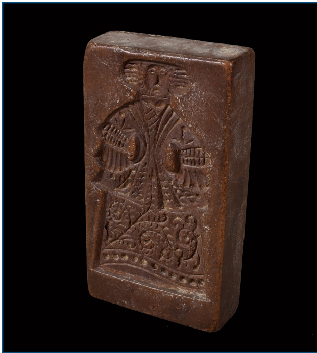
Christopher Ludwick's Cookie Board, 1754–1801, Museum of the American Revolution. Access an image of the artifact at https://www.amrevmuseum.org/collection/christopher-ludwicks-cookie-board .

As historians have often taken the Revolutionaries at their word, the perception of these soldiers as mercenaries has persisted for over a century, but new analysis suggests that these men had much less control over their circumstances and benefitted much less than one might assume a soldier of fortune would. 6 Interestingly, some even chose to desert their armies and blend into local German communities in the colonies, hoping life here would offer them a better chance at freedom. German immigrant Christopher Ludwick, a baker and confectioner who became Baker General of the Continental Army, was personally involved in recruiting them and even caring for German prisoners of war. What did the dream of freedom, liberty, and equality mean for them, and for Ludwick, as a more established immigrant? 7