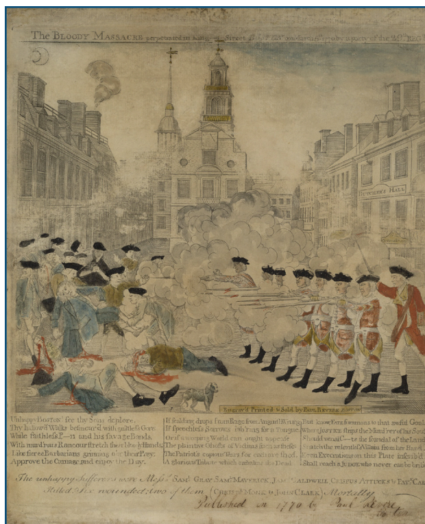
This engraving by Paul Revere, showing a line of disciplined soldiers mowing down unarmed civilians, depicts the oppression of a people by the army of their own ruler. To access a digital copy of this image, go to https://www.loc.gov/item/2008661777/.

Meanwhile, the dynamic between the British administration and white colonists continued to ratchet up the imperial conflict. A decision in 1773 to more closely oversee the governance of British colonies in India led to a new tax for tea in the American colonies. Although the new tax was balanced by a subsidy on tea imported by the government-supported East India Company, colonists warned that the Tea Act itself was another example of "Parliamentary despotism." 4