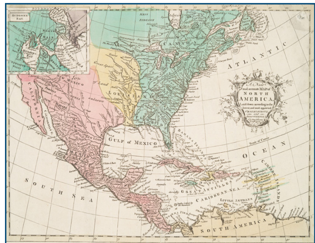
1763 map of European claims to North America. To access a digital image of this map, go to https://digitalcollections.nypl.org/items/510d47db-c2e5-a3d9-e040-e00a18064a99 .

These new regulations annoyed some colonists more than others. For example, in 1763, the British government proclaimed that British colonists could not claim land west of the Appalachian Mountains. This Proclamation line attempted to reduce violence between colonists and the hundreds of Indigenous nations who lived in North America. When the British government argued that colonial settlement in the west was illegal, it frustrated trans-Appalachian speculators, such as George Washington, who wished to sell land legally to other European settlers. Nonetheless, colonial squatters simply took the land, in defiance of both the wealthy proprietors who claimed it and the British army that was supposed to enforce the ban.