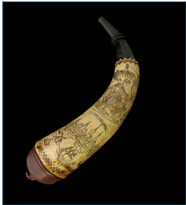
Philadelphia powder horn, c. 1770, Museum of the American Revolution (2003.00.0123). Link to an image of this artifact: https://www.amrevmuseum.org/collection/philadelphia-powder-horn .

People of African descent made up approximately one-fifth of the population of the colonies on the eve of the American Revolution. Most were enslaved, serving those who claimed to own them from the fishing and shipping communities of New England to the indigo, rice, and wheat plantations of the mid-Atlantic and American South. By the 1760s, some had lived in the colonies for generations, while others were recent arrivals. They were from cultural groups such as the Fon, Igbo, Hausa, Akan, and Mande, and brought a variety of skills, beliefs, and cultures with them. One way to learn more about their identities and roots, and their pathways to the European colonies to which they were forcibly taken, is to explore the many resources available at slavevoyages.org . Historic Hudson Valley's project, People, Not Property ( peoplenotproperty.hudsonvalley.org/ ), explores what life was like for these men, women, and children as they worked to build communities despite the hardships of their enslavement. Sites like The Geography of Slavery ( www2.vcdh.virginia.edu/gos/ ), and Slave Revolt in Jamaica, 1760-1761 ( revolt.axismaps.com/ ) help to illustrate how enslaved people of African descent resisted their status as property, both in the mainland colonies and in the British Caribbean.