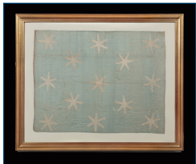
Washington's Headquarters Flag, 1777–1783, Museum of the American Revolution. You can access an image of this artifact here: https://www.amrevmuseum.org/collection/washingtons-headquarters-flag .

During World War II, the U.S. government created a poster to encourage and inspire Americans on the homefront to serve their country. Alongside images of modern troops, it featured the phrase “Americans will always fight for liberty,” images of Continental Army soldiers, and the flag that is believed to have flown at George Washington's headquarters and to have traveled with him on the field. This poster can be seen online in the Museum's Multimedia Timeline of the American Revolution .