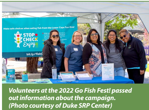
Volunteers at the 2022 Go Fish Fest! passed out information about the campaign.

The Duke SRP CEC launched the Stop, Check, Enjoy! campaign in June 2018 to help inform the public about the risks of eating certain fish that are caught from contaminated waters, as well as methods to prepare fish to avoid or limit exposure to contaminants. 4