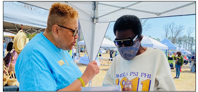
An NC Coastal Federation Board member speaks with a community member about fishing consumption advisories.