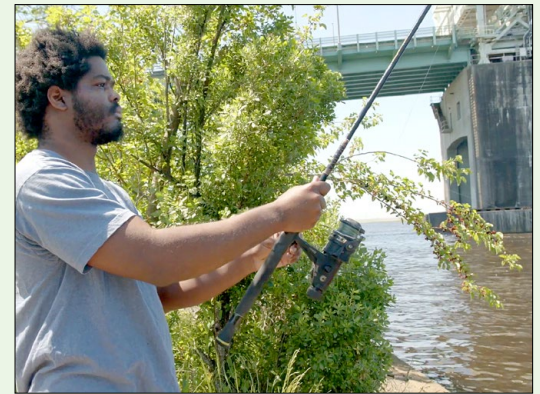
An individual fishing from the Cape Fear River.

"We're adjusting our strategy to align with the latest research," noted Shapiro-Garza. "It's a bit of a moving target, which isn't unique to PFAS, but it's a challenge that a strong coalition of community and academic partners, such as this, is uniquely positioned to address."