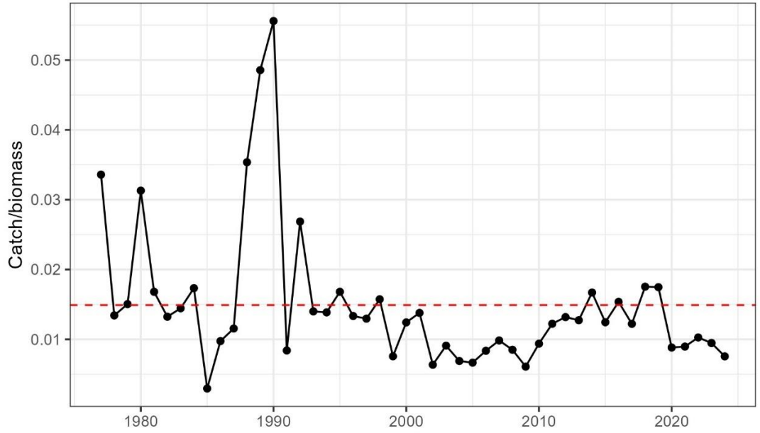
Figure 13.3. Catch divided by biomass (age 3+) for GOA RE/BS rockfish, 1977-2024. The red dashed line is the long-term average for the time series (0.015). Age-3+ biomass estimates for 1977-2022 and 2023-2024 were obtained from the 2023 assessment and 2024 projection models, respectively. The assumed projected total catch for 2024 is 348 t.