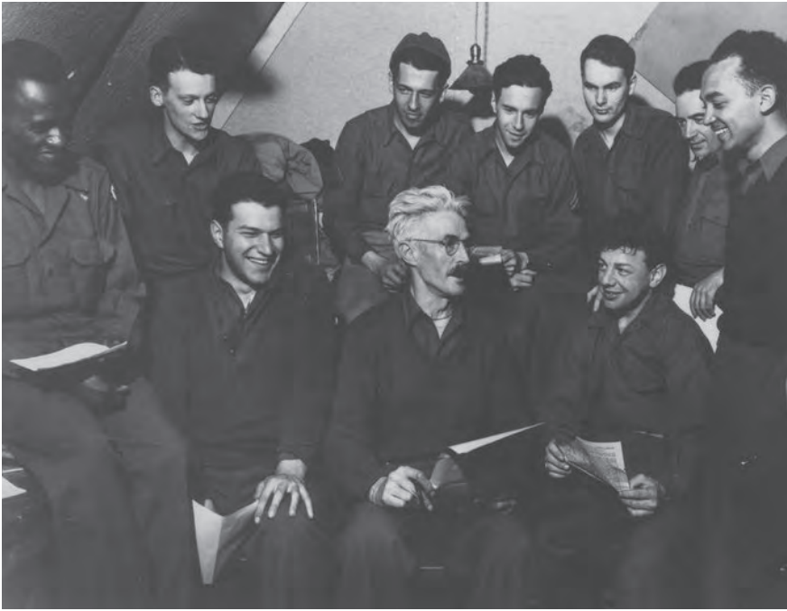
Hammett with the integrated Staff of the Adakian c. 1942–43.

publisher, and editor led the army to accept him into the signal corps. By the summer of 1943, over fifty thousand troops deployed across the islands, mobilizing to expel the Japanese. Hammett assembled a group of men to write training manuals, organize variety shows and lectures for the radio, and print a newsletter, entitled the Adakian , for the troops to read about the war's progress. They eventually published The Battle of the Aleutians .