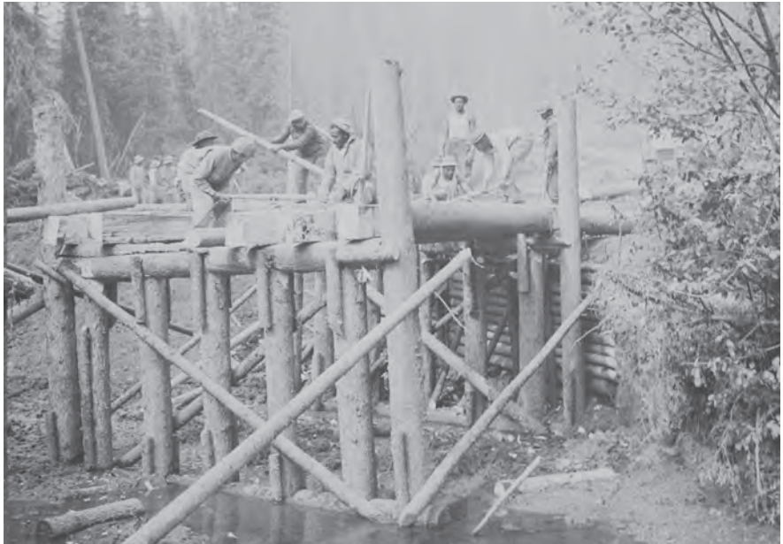
Soldiers of the African American Ninety-Fifth General Services Regiment at the Sikanni Chief River Bridge, British Columbia, 1942.