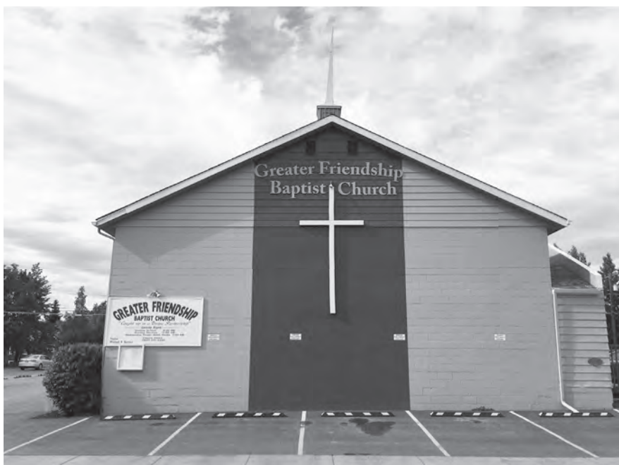
Greater Friendship Baptist Church, a longtime site of worship and activism in Anchorage's black community. Photo courtesy of David Reamer, 2018.

In 1951 black men and women gathered in the basement of the First Baptist Church. Once the congregation grew, they separated and met at nearby Pioneer Hall. Soon after, the men and women raised money and constructed their present house of worship, calling it the Greater Friendship Baptist Church. They composed Alaska's first black congregation. But more