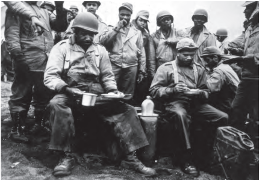
This photo of black troops was taken on May 20, 1943, nine days after the invasion of Attu Island on Massacre Bay, Attu, Aleutian Islands.

Aleutians and recalled those who ended up in the Aleutians typically fell into one of three categories: “troublemakers, homosexuals, and P.A.F.s.” P.A.F. stood for Premature Anti-Fascists, a moniker given to outspoken leftists who were sympathetic to the Russian Revolution, civil rights, and organized labor and supported the Republican faction in the Spanish Civil War that raged through the late 1930s. Not surprisingly, a relatively large contingent of black troops ended up in this theater of war as well.