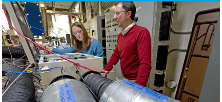
Researchers accurately monitor the nation's emerging efficiency products for indoor comfort at the Advanced HVAC Systems Laboratory.