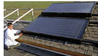
Low-cost solar collectors for cold climates are being developed and studied at the TTF's Hot Water Systems Lab.

The Hot Water Systems lab provides a suite of evaluation capabilities for a wide variety of hot water components and assemblies including natural gas heaters from tankless to small boilers, electric heaters from on-demand products to large heat pump water heaters, and solar water heaters. Detailed distribution and draw profile simulation can be applied to explore system performance at many scales. The lab will also provide the ability to simulate hydronic heating systems and condition inlet water to simulate mains water temperature for any U.S. climate region.