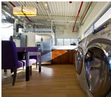
Up to 20% of a home's energy can be saved in a seamless, unobtrusive way. The AHM lab is developing strategies to get us there.

NREL's Automated Home Energy Management (AHM) lab is a robust test bed for home energy systems. Any product developed for home sensing, energy management and control can be studied at multiple scales, from component to whole-house to community level.