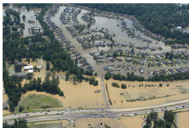
Aerial image showing flooding in Louisiana. August 14, 2016.