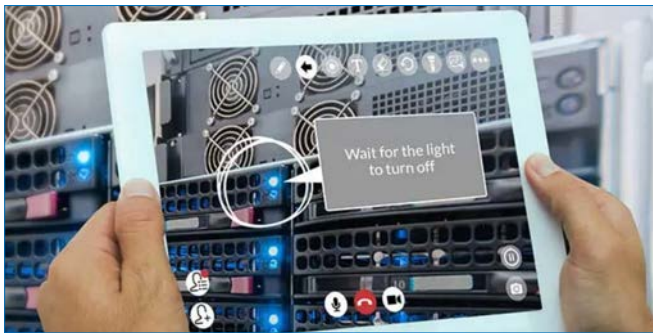
Xerox's CareAR Service Experience Management platform