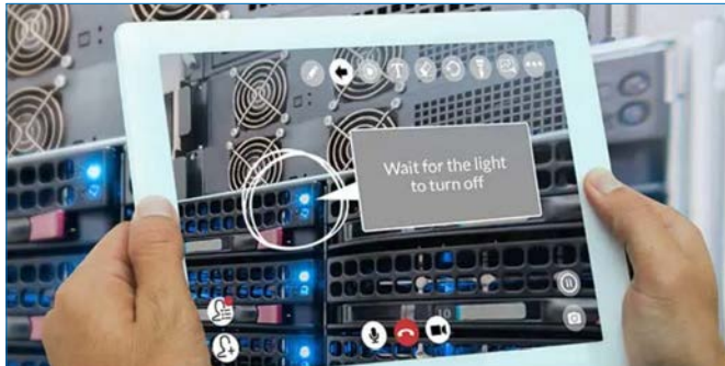
Xerox's CareAR Service Experience Management platform