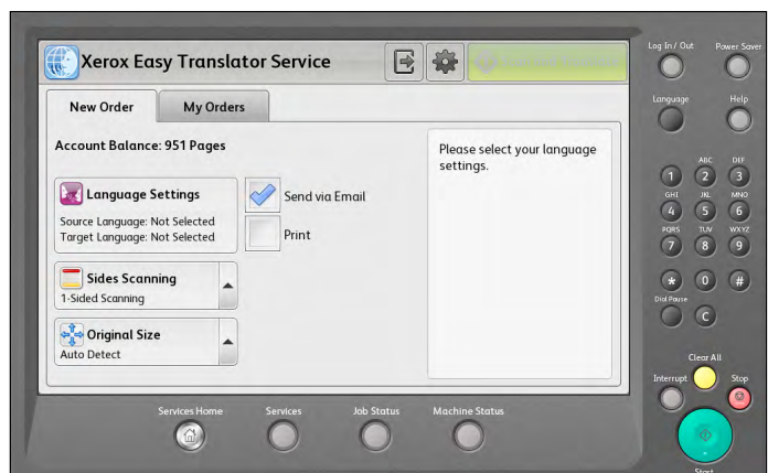
Xerox Easy Translator Service MFP user interface