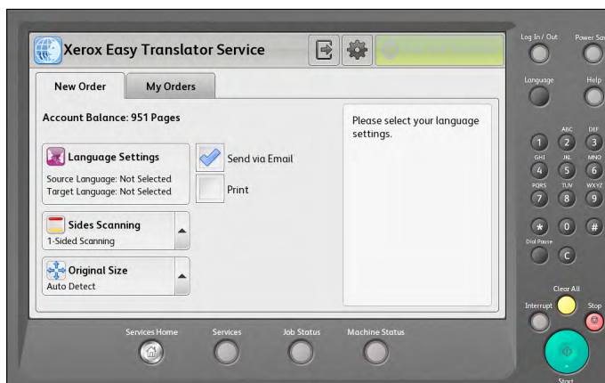
Xerox Easy Translator Service MFP user interface