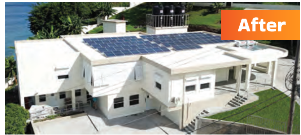
The Chateaubelair 'Smart' Hospital in St. Vincent and the Grenadines continued responding to the COVID-19 pandemic during and after the volcanic eruption in 2021.

'Smart' gold standard implementation helps save lives, protect people, infrastructures, and investment, and ensures health facilities are better able to cope with risks they face now and into the future.