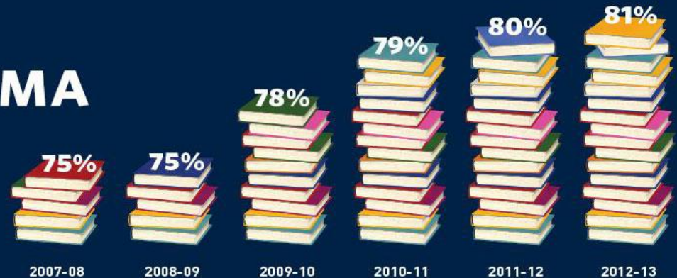
HIGH SCHOOL GRADUATION RATE

UNDER PRESIDENT OBAMA, MORE STUDENTS ARE EARNING THEIR HIGH SCHOOL DIPLOMA THAN EVER BEFORE