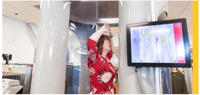
Airport scanners for safer travel