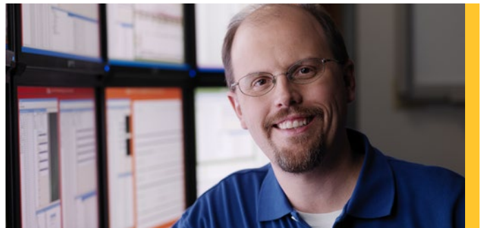
Digital Ants that identify cyber attacks