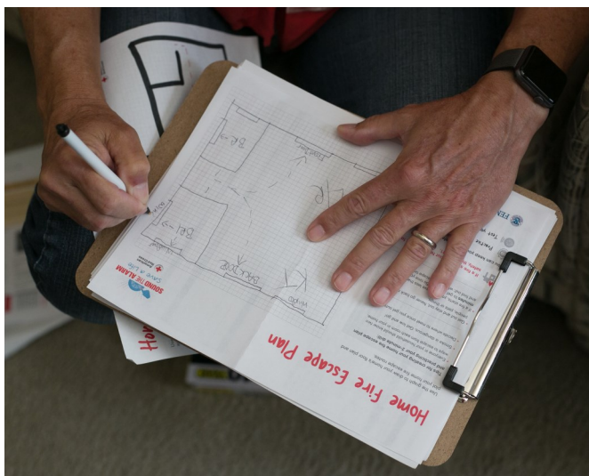
Red Cross fire safety experts can conduct virtual home visits to help families review or develop a fire safety plan. Please help us recruit more families.

You also can commit to educating those in your network about home fire safety. To engage in this way, please contact scott.davis2@redcross.org. We'll equip you with the knowledge