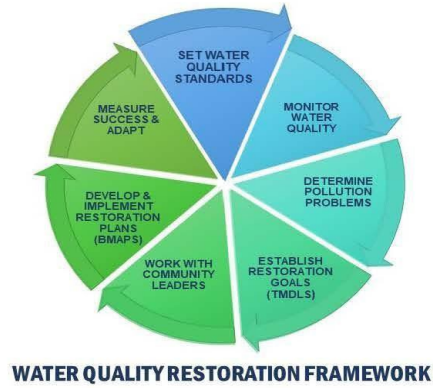
Figure 3 depicts Florida’s water quality restoration framework using TMDLs and BMAPs.