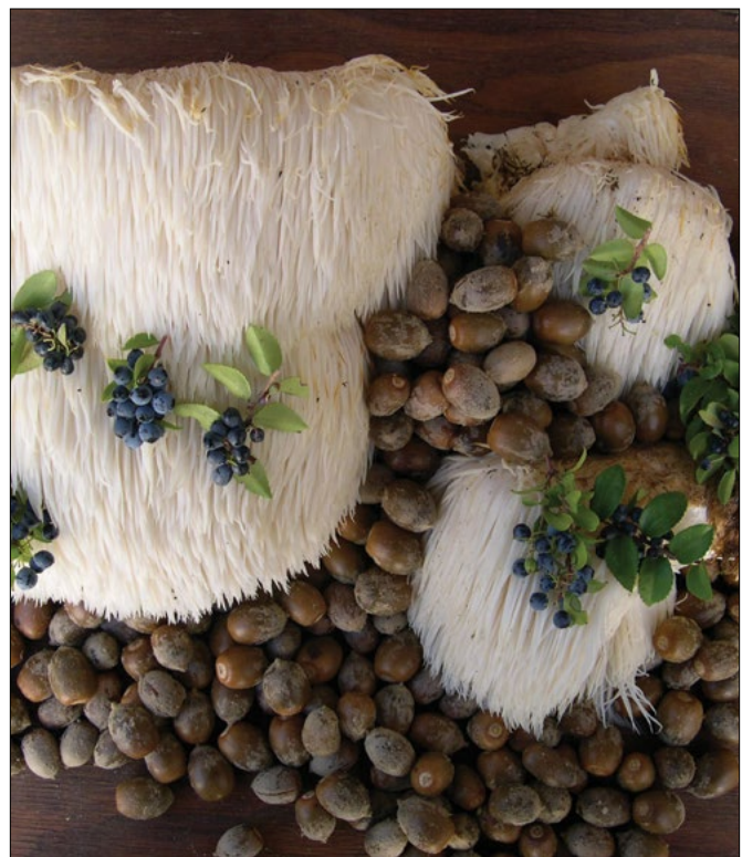
Figure 4.3 —Nontimber forest product foods are central to the material and cultural survival of indigenous peoples. Lion’s mane mushroom ( Hericium erinaceus (Bull.) Persoon), tanoak acorns ( Notholithocarpus densiflorus (Hook. & Arn.) Manos, Cannon, & S.H. Oh), and evergreen huckleberries ( Vaccinium ovatum Pursh) are foods important to the Karuk and other tribes of northern California.

Access to and uses of NTFP foods are central to the cultural survival of peoples, as well as their material survival (figure 4.3). Food is a key ingredient in bringing families and larger social groups together to celebrate, define, and maintain their identity (Reddy 2015). An indication of the importance of edible NTFPs to identity is their role in foundational cultural teachings. For example, the Mohawk creation story, Tsi Kiontonhwentsison , describes how strawberry seeds ( Fragaria spp.) were carried to this world from the Sky World. Today, strawberry drinks continue to be served during ceremonies and other community events (Hoover 2010). Anishinaabe (also known as Ojibwe or Chippewa) teachings relate how, expelled from their territory in the East, the Anishinaabe were instructed to travel west until they found “the place where food grows