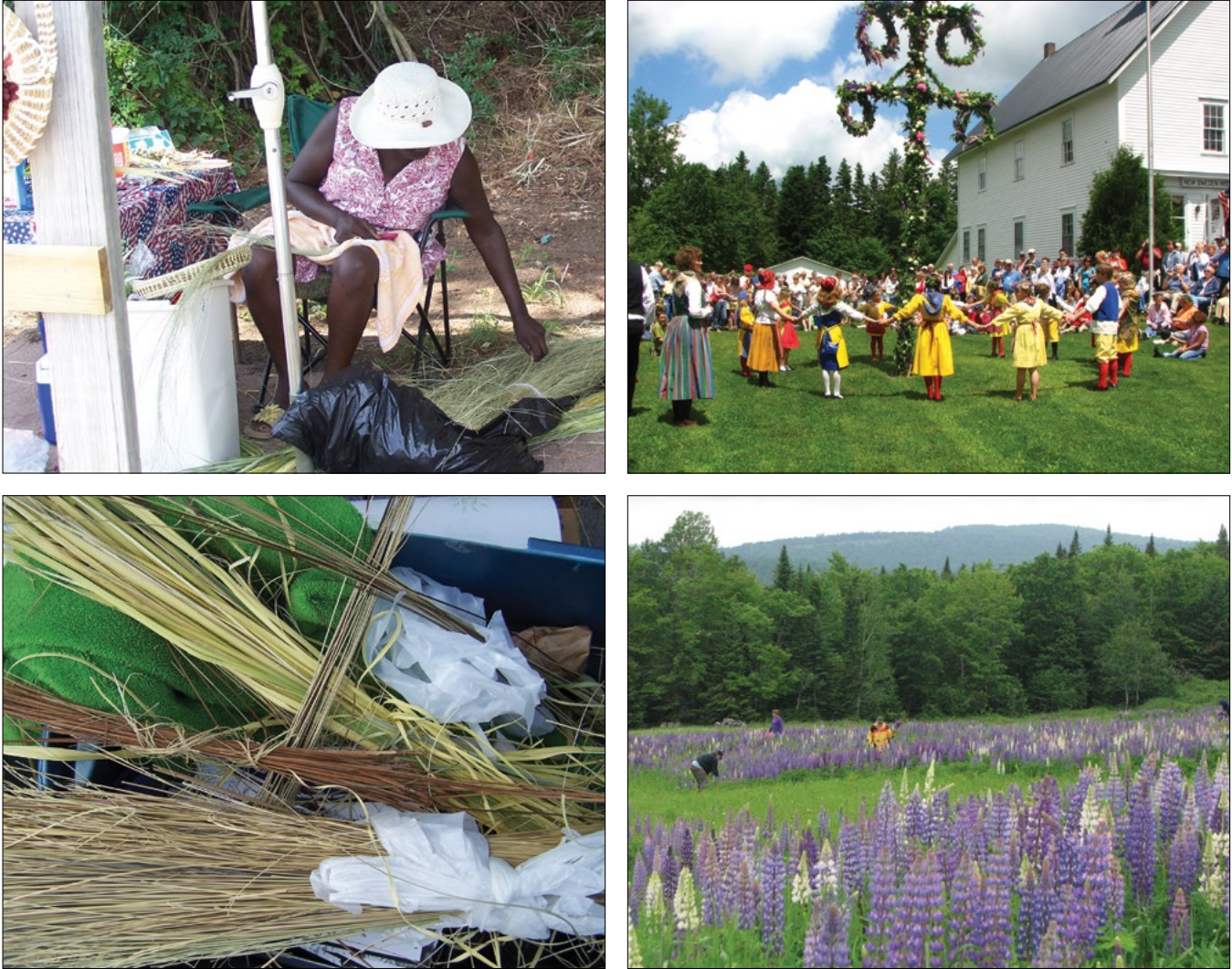
Figure 4.1 —Harvest and use of nontimber forest products sustain cultural identities for diverse peoples. For example, making baskets from bulrush needles ( Juncus roemerianus Scheele), strips of palmetto leaves ( Sabal palmetto (Walt.) Lodd.), longleaf pine needles ( Pinus palustris Mill.), and blades of sweetgrass ( Muhlenbergia filipes M.A. Curtis) is important to the culture and economy of contemporary Gullah/Geechee artisans in South Carolina (top and bottom left). Lupines ( Lupinus spp.) and other plant material harvested by the Swedish colony of northern Maine are used in its Midsommar Fest (top and bottom right).

generations or a few years. Some examples of cultural uses of NTFPs by nonindigenous peoples include Gullah/Geechee basketmaking traditions (Hurley et al. 2008), lupines ( Lupinus spp.) and other plant materials harvested by the Swedish colony of northern Maine for its annual Midsommar Fest (Baumflek et al. 2010), the iconic status of ramps ( Allium tricoccum Aiton) as a regional food in the Appalachian Mountains (Hufford 2000, Shortridge 2005), and the values of harvesting and eating brackenfern fiddleheads ( Pteridium spp.) for Japanese and Korean immigrants to southern California (Anderson et al. 2000).