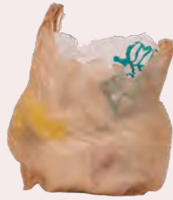
Plastic Bags Bubble Wrap Plastic Film