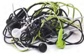
Cords and Holiday Lights

Clean and dry plastic bags and film can be dropped off at grocery or retail stores for recycling at no cost. Find locations at BagandFilmRecycling.org Use reusable bags when possible to reduce waste.