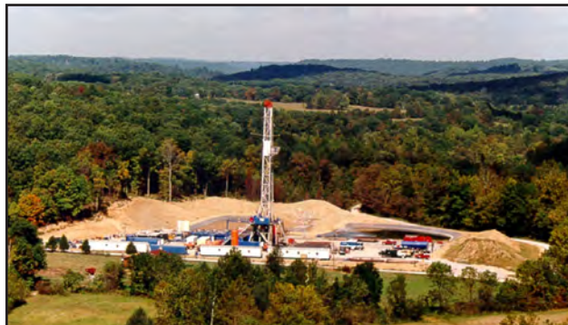
Conoco #1 Shain Well, Grayson County Ky. Total depth 12,622 ft. Drilled in 1993.

The U.S. Department of Energy has determined that deep, porous, saltwater-bearing rock formations provide the best choice for permanent storage of large volumes of CO 2 . The Kentucky Consortium for Carbon Storage will drill at least two wells to collect data and conduct injection testing of subsurface reservoirs in Kentucky. These wells will add to our sparse data set for deeper formations, and help assess Kentucky's potential for CO 2 storage.