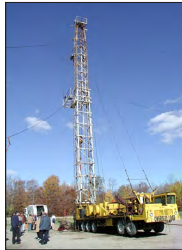
Drill rig and logging truck at CO 2 storage demonstration site in the Michigan Basin.

The Kentucky Geological Survey, a research center of the University of Kentucky, will manage the consortium and lead the research. KGS has been involved in carbon storage research for more than 7 years, and is currently participating in three U.S. Department of Energy-funded regional CO 2 partnerships, and several State-funded storage projects. KGS researchers have expertise in regional subsurface geology, reservoir analysis, seismic interpretation, geochemistry, and coal geology.