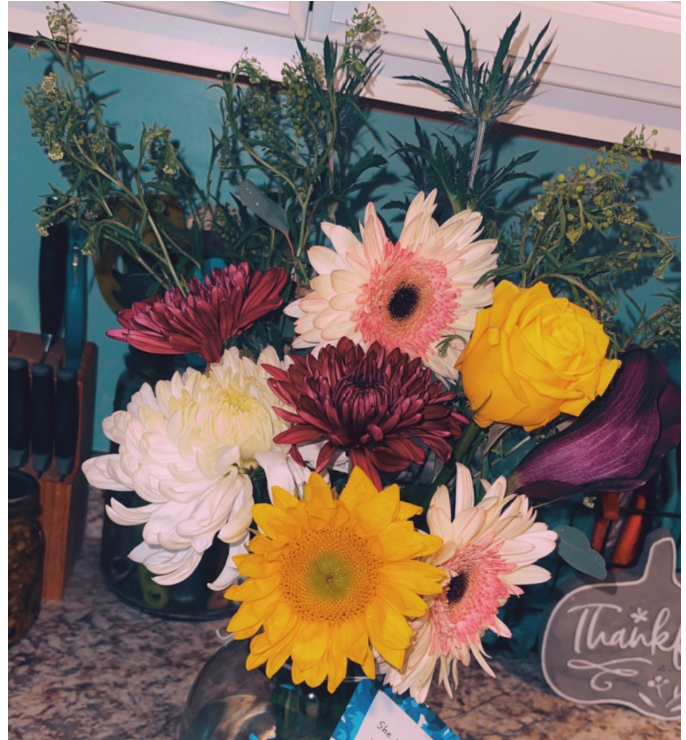
Cut flower arrangement sourced with cut flowers from a local grocery store, August 2021

The CSA model allows a slice of freedom for the grower. The most common form of a cut flower CSA is the “grower’s choice” arrangement. This model allows the grower to work with the