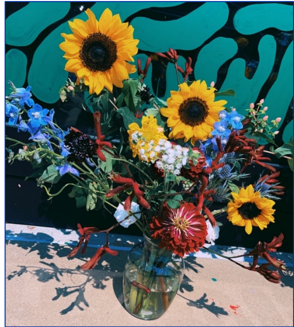
Figure 2: Cut flower arrangement made with local Kentucky flowers, July 2021.

mand. High tunnels or other cold frames are an effective way to extend the season into both the fall and early spring months. High tunnels come