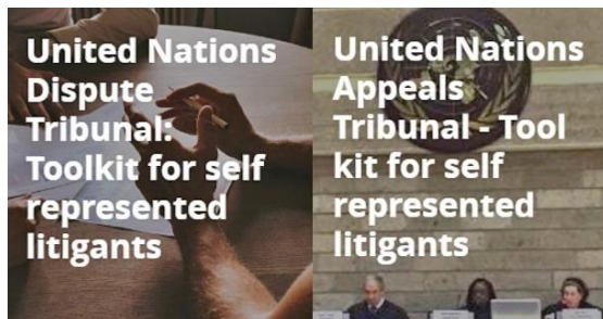
A toolkit for self-represented litigants is available for both the United Nations Dispute Tribunal and United Nations Appeals Tribunal .

Timeline: An application to the United Nations Dispute Tribunal must be filed within 90 calendar days of receipt of the management evaluation outcome or – if you have not received a response – within 90 calendar days from the moment the management evaluation outcome was due (which is within 30 days from the day you submitted your request if you work at New York Headquarters, or 45 days, if you work at an office away from Headquarters). In cases where management evaluation is not required, the application should be filed within 90 calendar days of when you were notified of the decision. If you have sought mediation through the Mediation Division of UNOMS, you have to file the application within 90 calendar days from the day the mediation ended unsuccessfully.